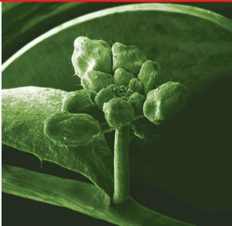
Back-up copies: mutant DNA in the cress plant may be 'corrected' by inherited RNA.

plant could perform such a feat. One idea is that they carry a back-up copy of their grandparents' genetic information encoded in RNA that is passed into seeds along with the regular DNA and is then used as a template to 'correct' certain genes. Conceivably, Pruitt says, some of the mystery non-coding transcripts could be responsible. "I think there's something being inherited outside what we think of as the conventional DNA genome."