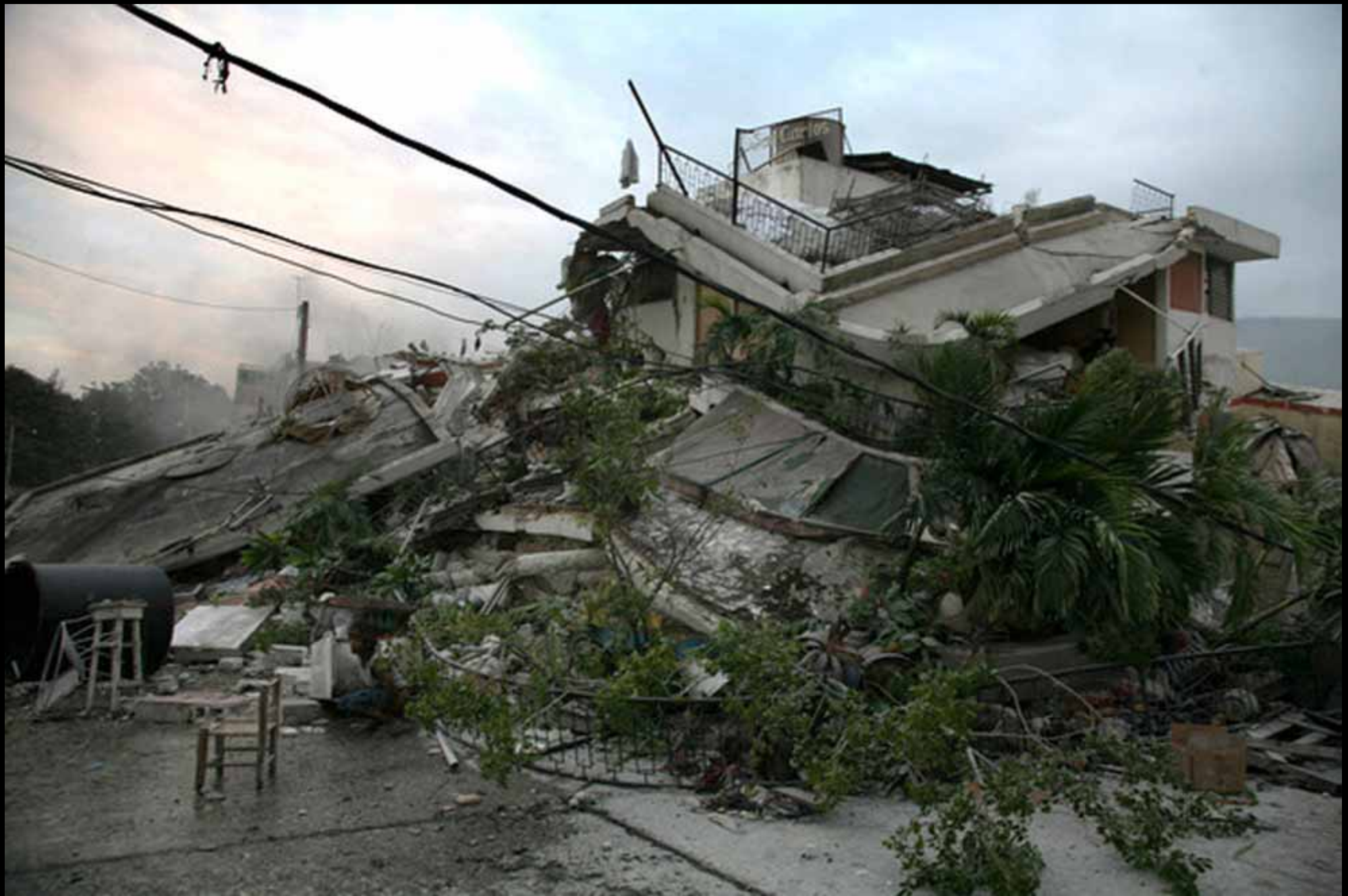
16 A person sits on the ground in front of a destroyed building in Port-au-Prince after a huge earthquake on January 12, 2010. #