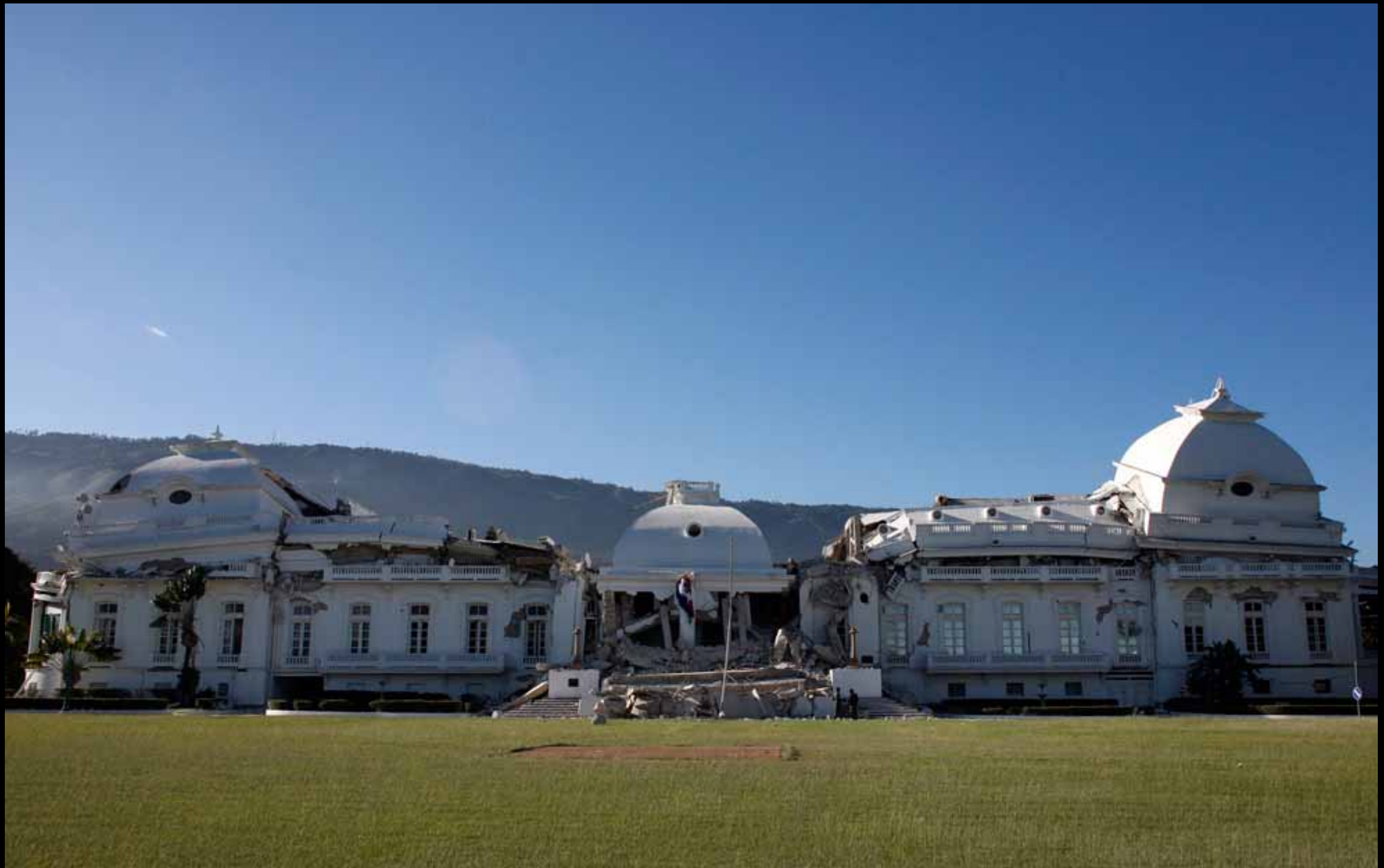
13 A view of the badly damaged presidential palace - the center portion formerly 3 stories tall - after an earthquake in Port-au-Prince, Haiti on January 13, 2010. #