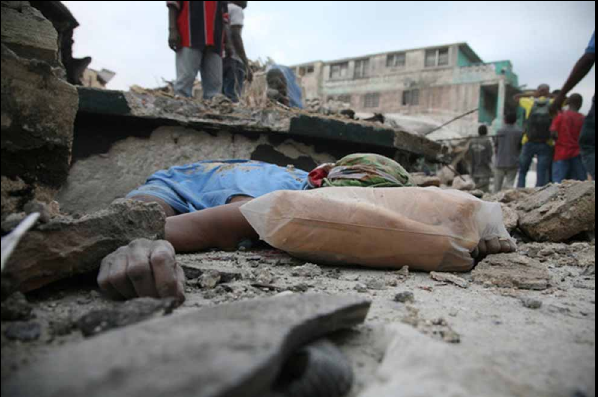
3 A body lies amid rubble on January 12, 2010 in Port-au-Prince after a huge earthquake. #