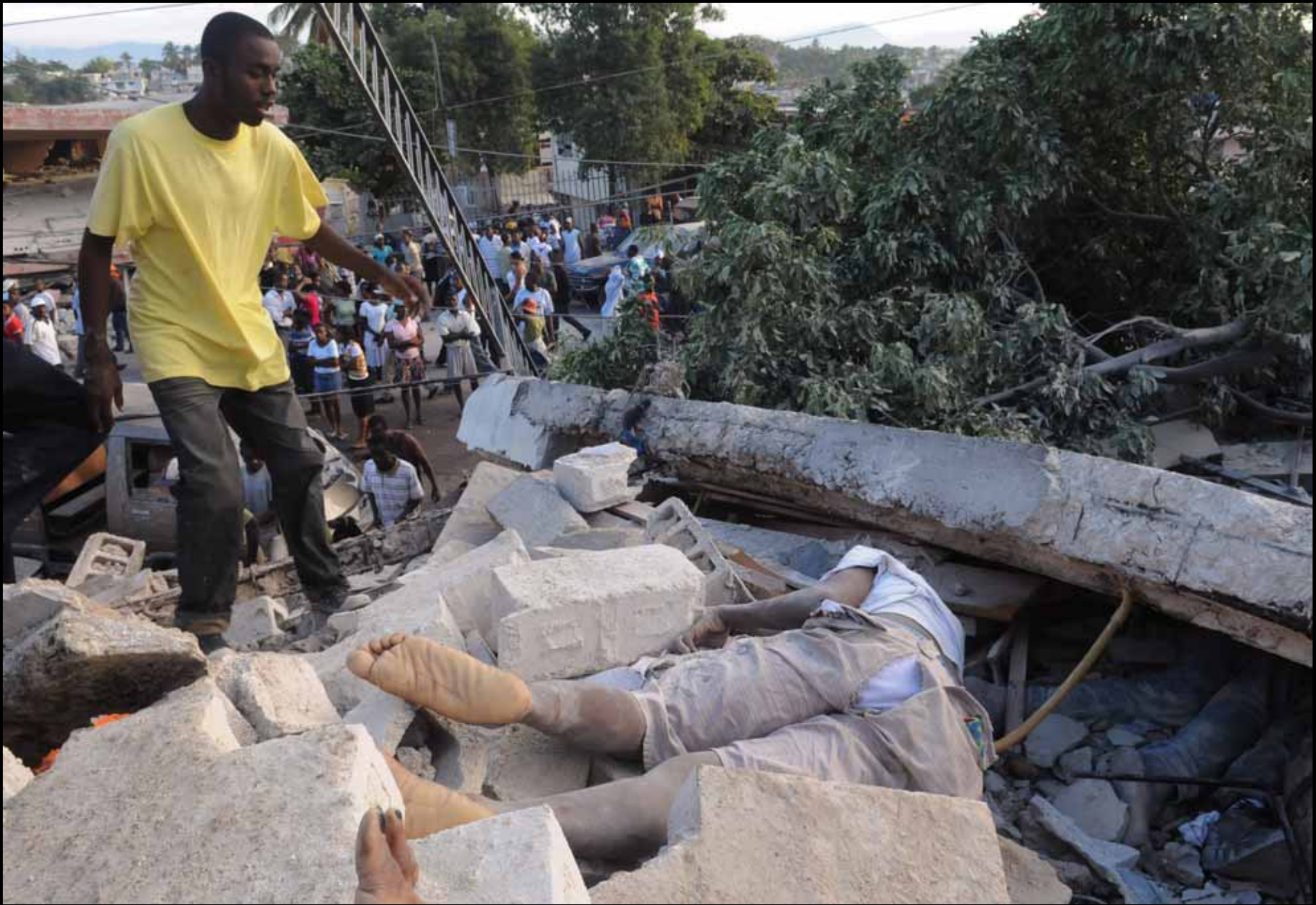
41 A person approaches several bodies lying in the rubble along Delmas road the day after an earthquake struck Port-au-Prince, Haiti, Wednesday, Jan. 13, 2010. #