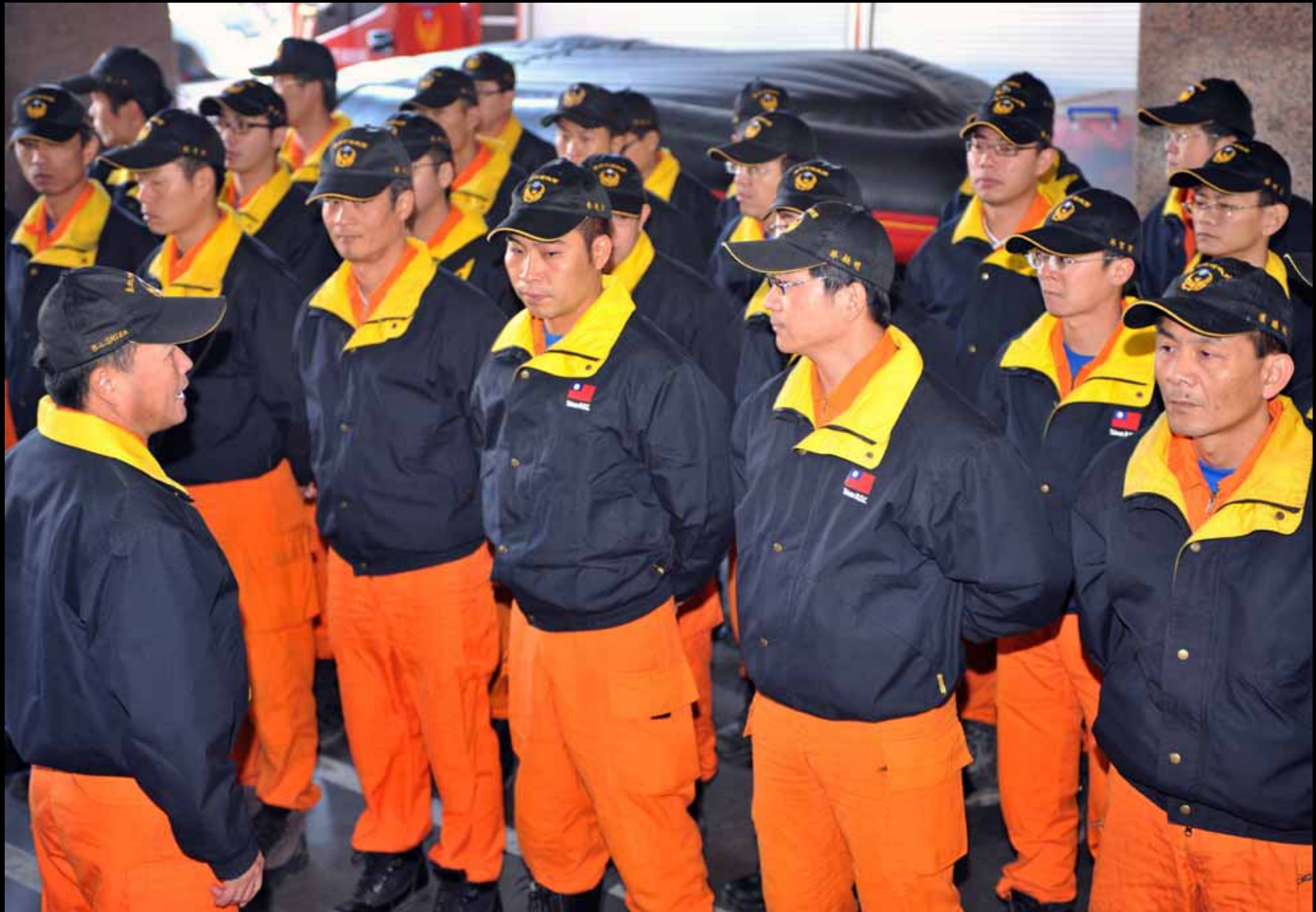
35 Taiwan rescue teams stand by at the fire department in Taipei on January 13, 2010 as they prepare to head to Haiti to help with the rescue effort following an earthquake. #