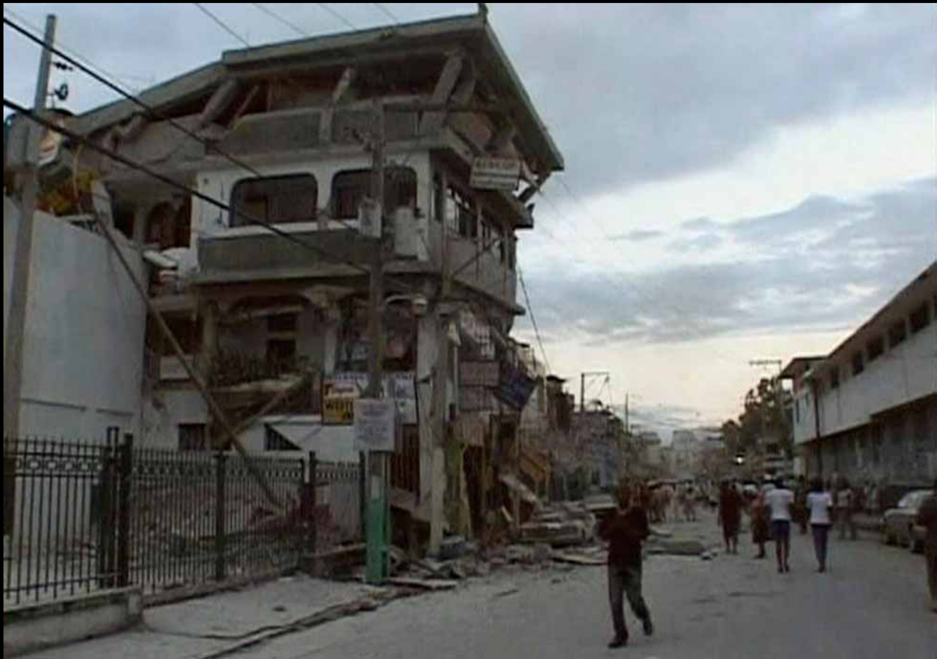
11 People walk along a street lined with buildings, which were destroyed after a major earthquake struck, in Port-au-Prince in this January 12, 2010 video grab. #