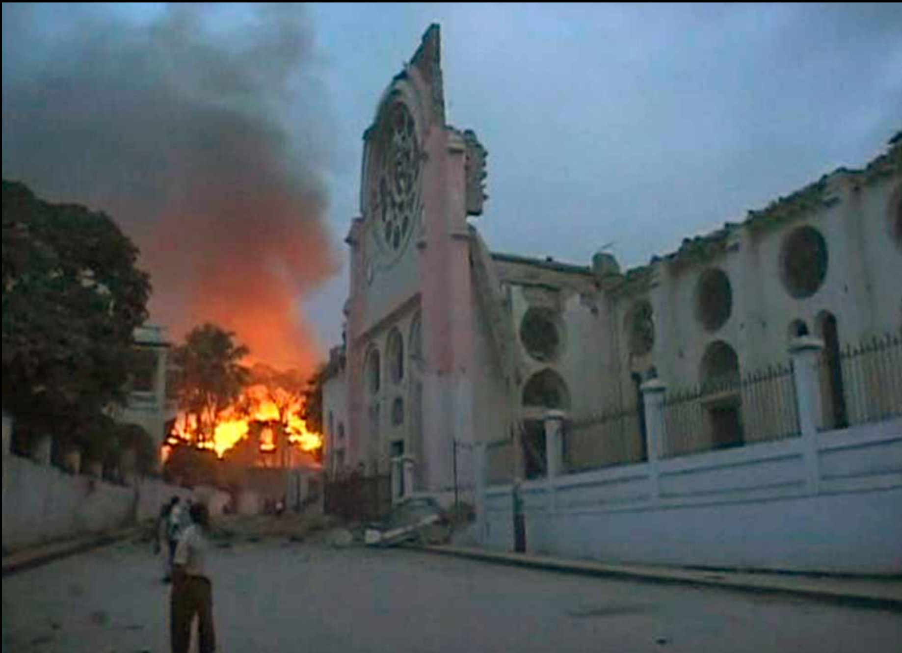
4 A fire breaks out near a building, which was damaged after a major earthquake struck, in Port-au-Prince in this January 12, 2010 video grab. #