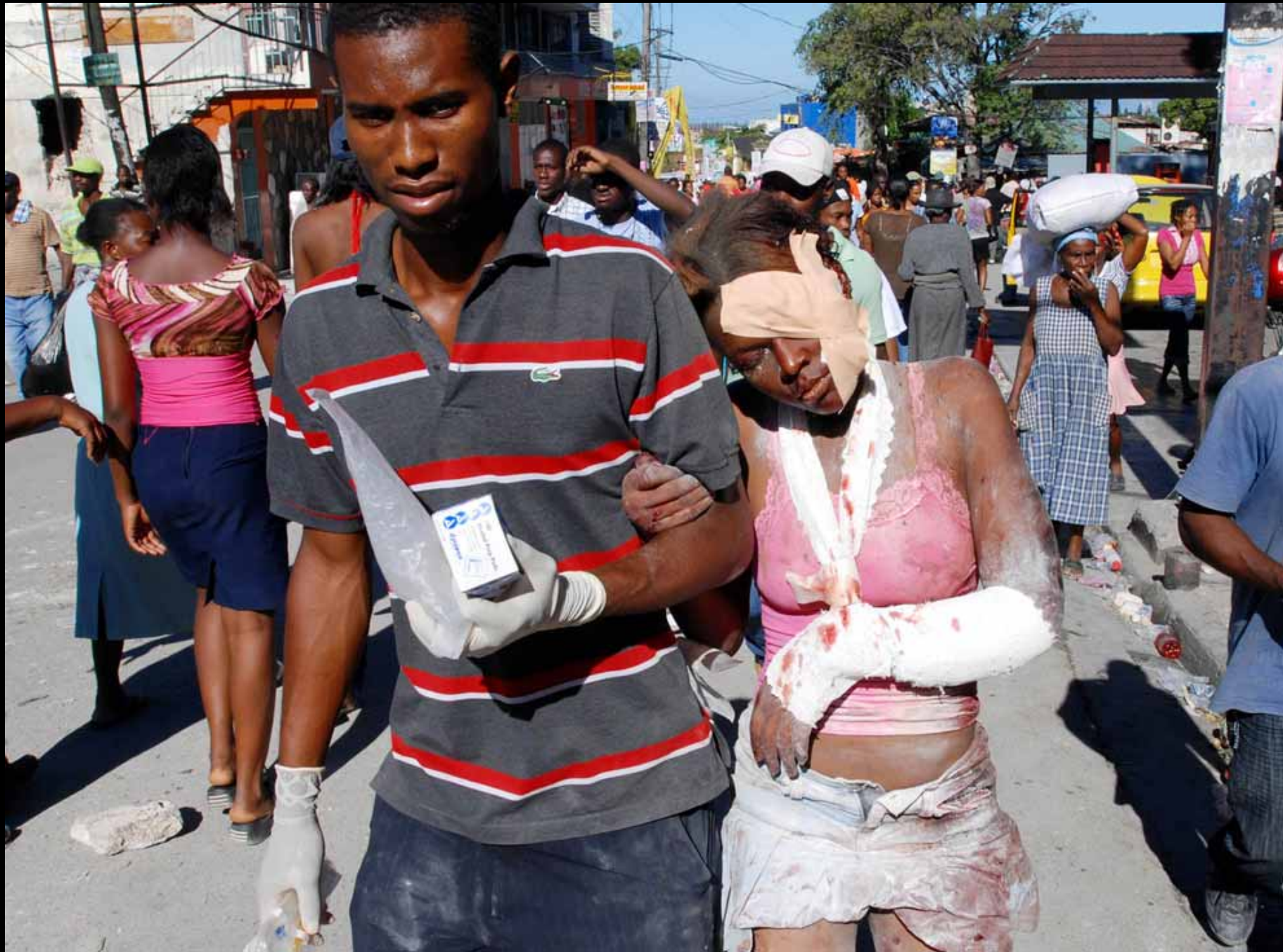
40 An injured woman is helped after being rescued on January 13, 2010 in Port-au-Prince, Haiti. #