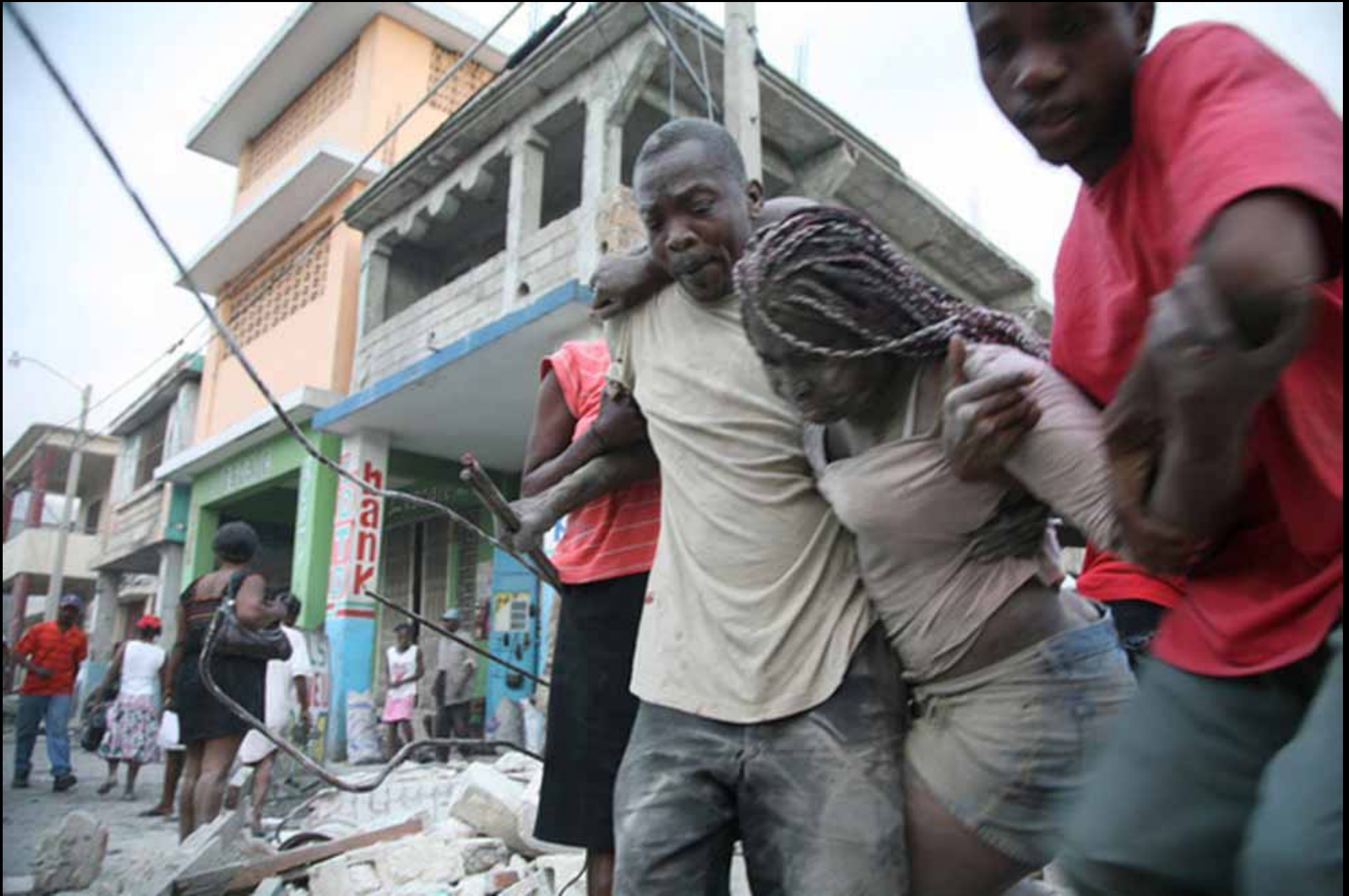
15 A woman is helped to safety after being trapped in rubble on January 12, 2010 in Port-au-Prince, Haiti. #