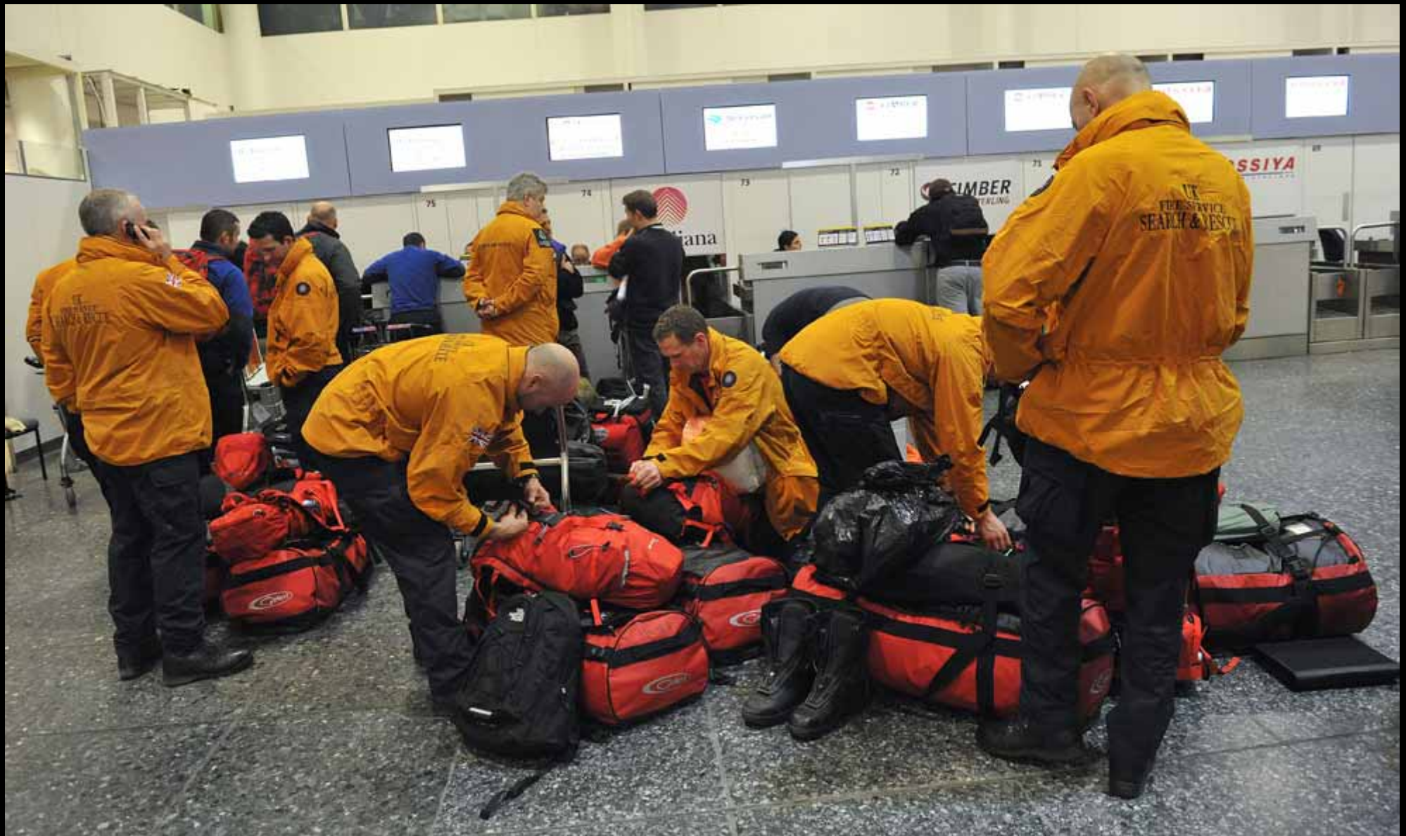
34 British Search and Rescue teams prepare to leave Gatwick airport, West Sussex to provide assistance to relief and rescue teams in Haiti, on January 13, 2010. #