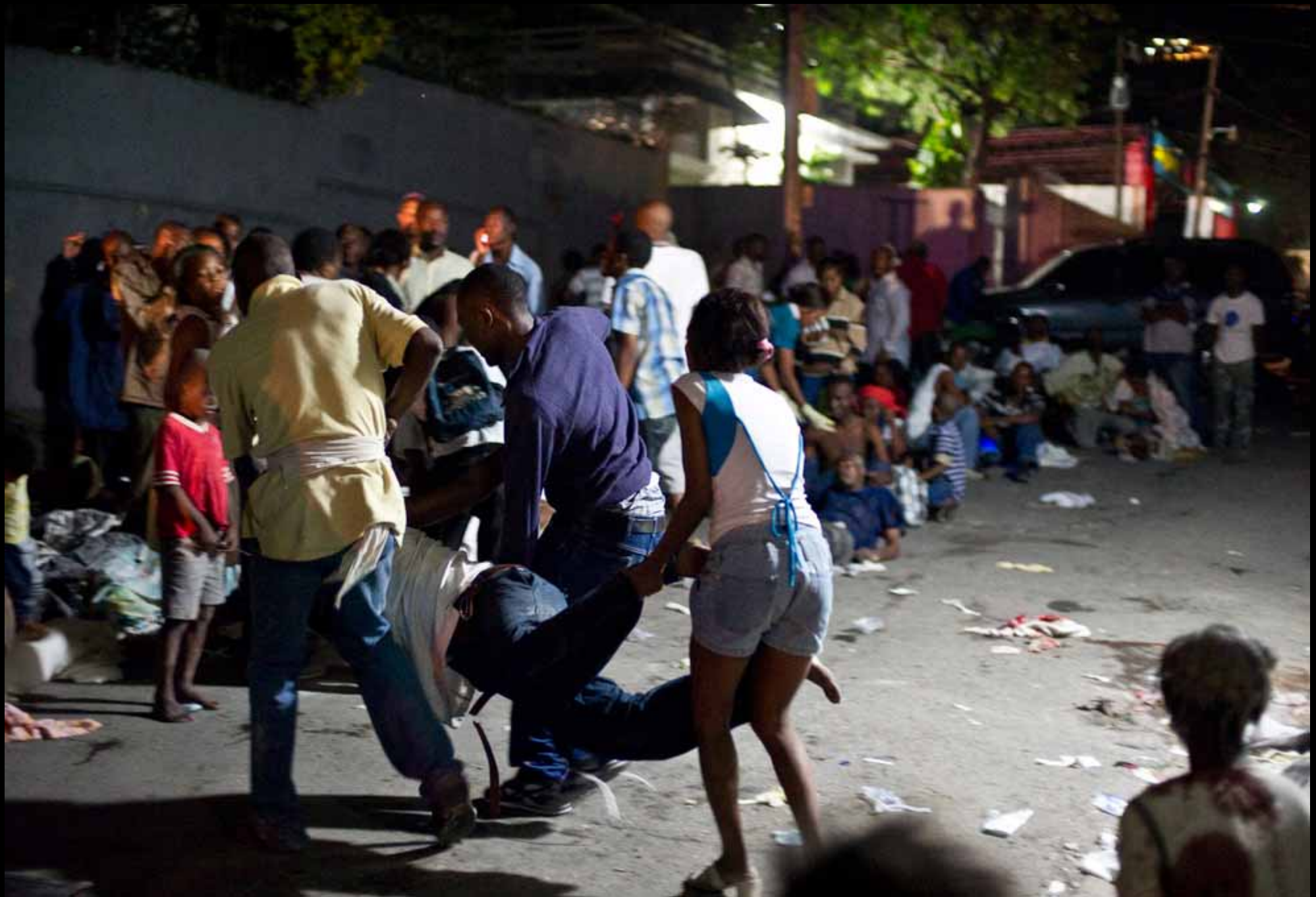
24 Displaced people carry a wounded man out of a clinic as aftershocks occur, following a major earthquake on January 13, 2010 in Port-au-Prince, Haiti. #