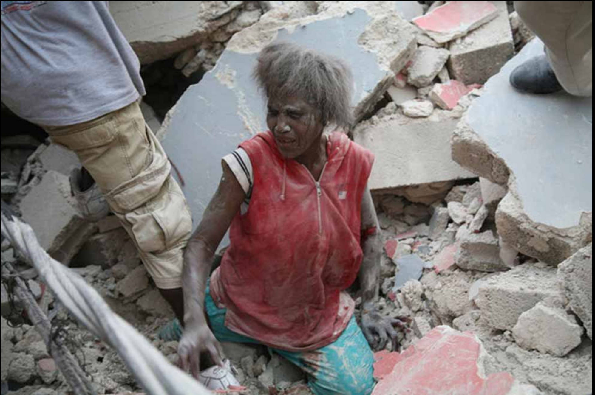
14 A Haitian woman is helped from the rubble of a damaged building on January 12, 2010 in Port-au-Prince after a massive earthquake struck the Caribbean nation. #