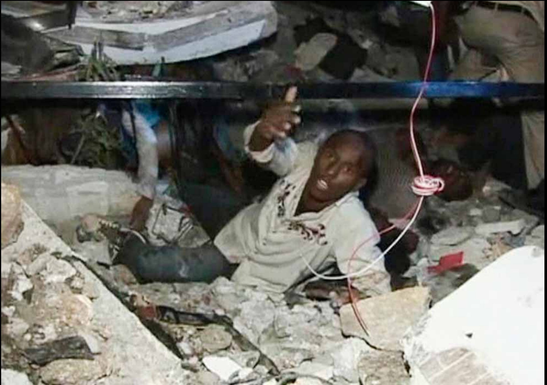
9 A man calls for help while being trapped at the Port-au-Prince University, after a major earthquake struck, in Port-au-Prince in this January 13, 2010 video grab. #