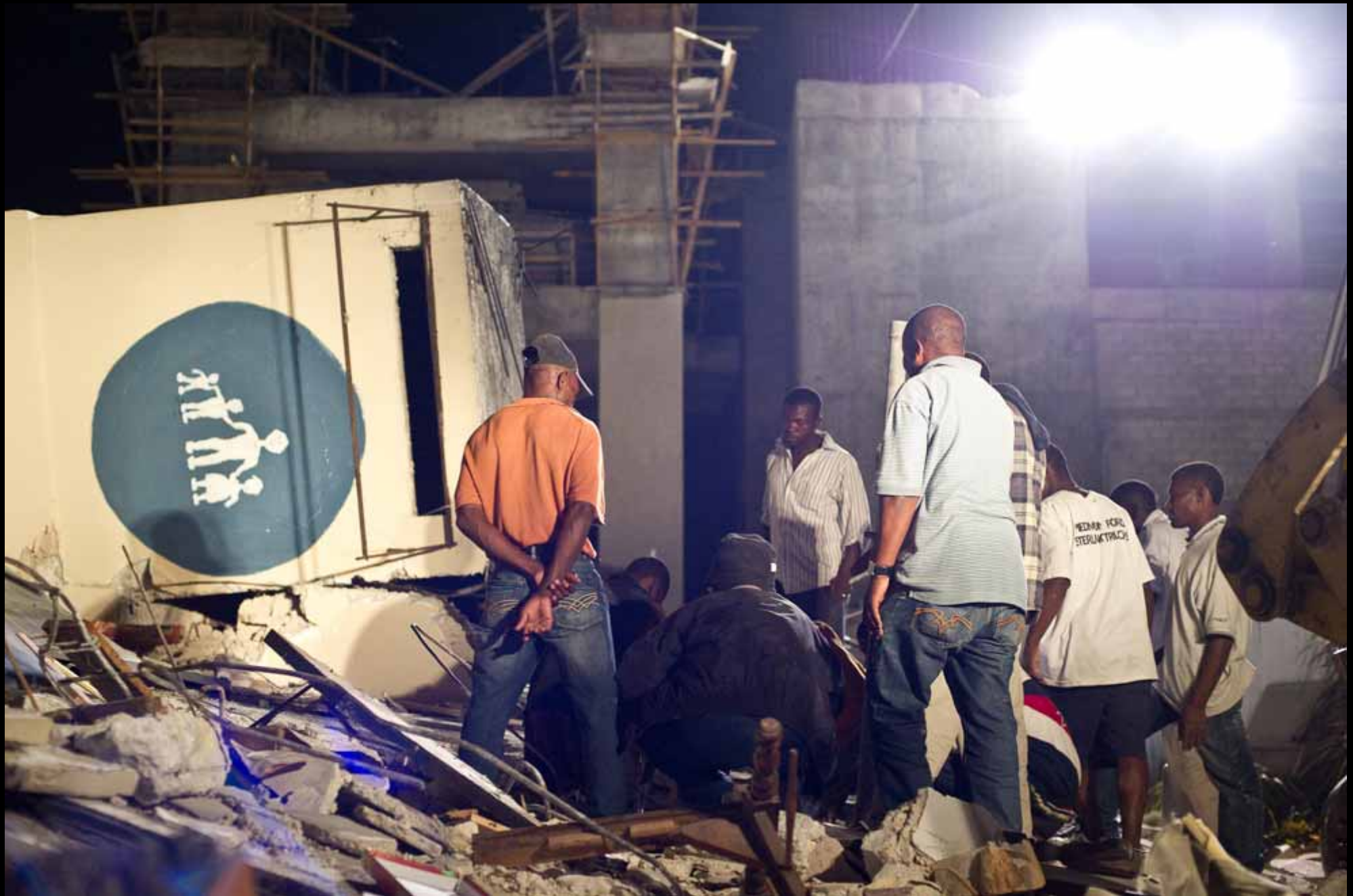
26 People search for survivors amongst the ruins of the children's hospital, following a major earthquake on January 13, 2010 in Port-au-Prince, Haiti. #