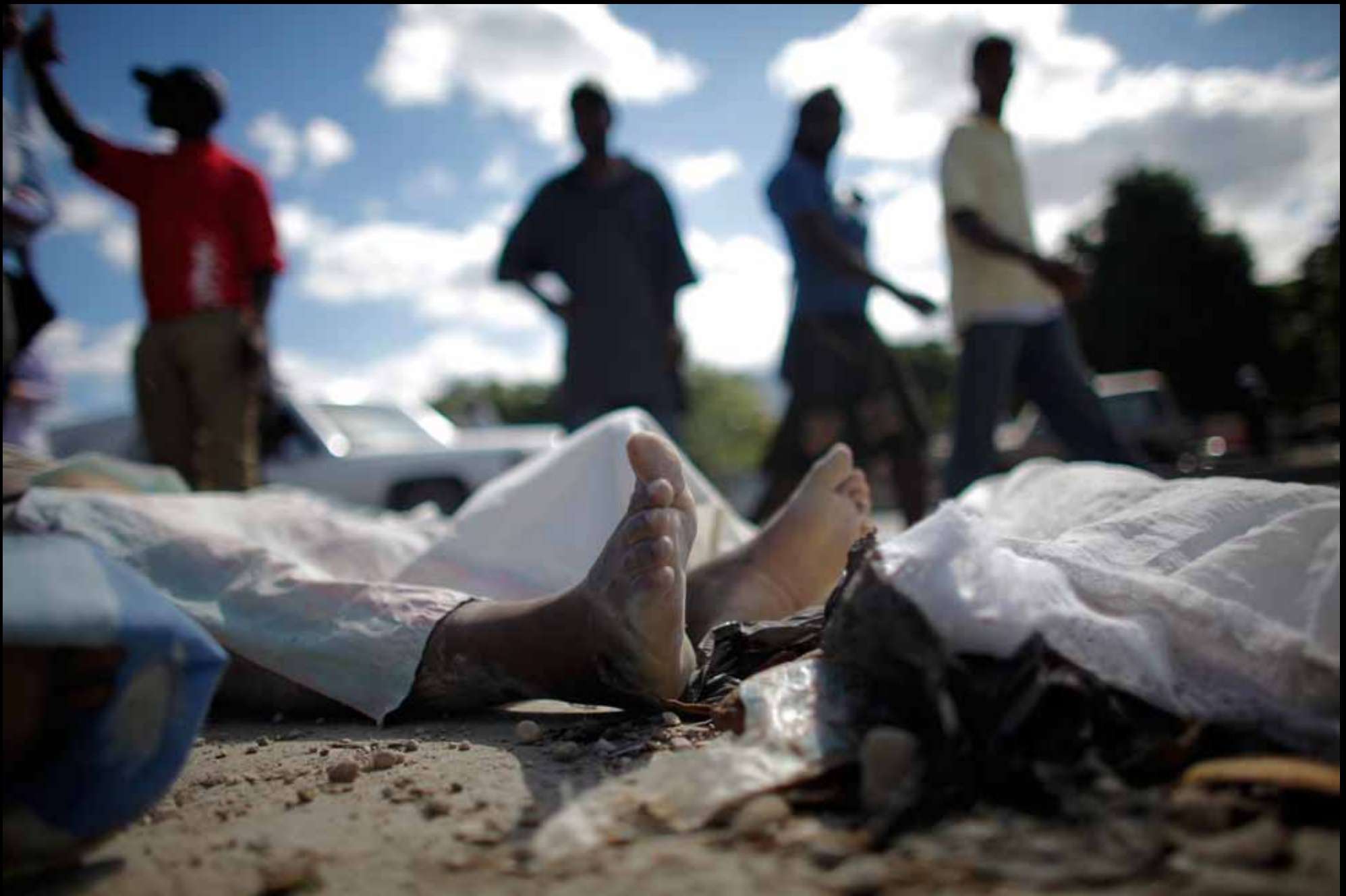
47 Residents walk past a dead body after an earthquake in Port-au-Prince January 13, 2010. #