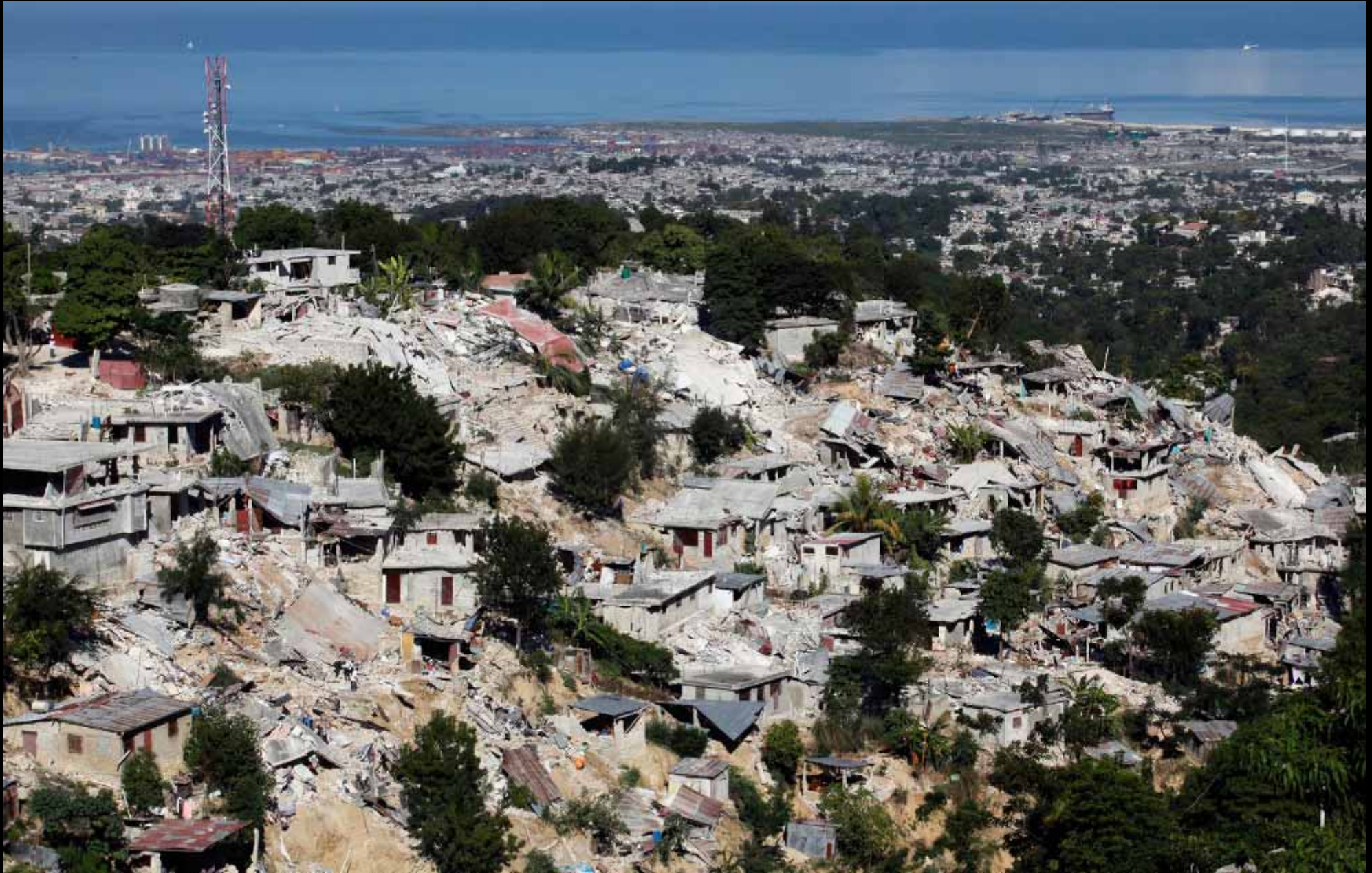
37 A view of a damaged neighborhood in the Canape-Vert area on January 13, 2010, after an earthquake the day before in Port-au-Prince, Haiti. #