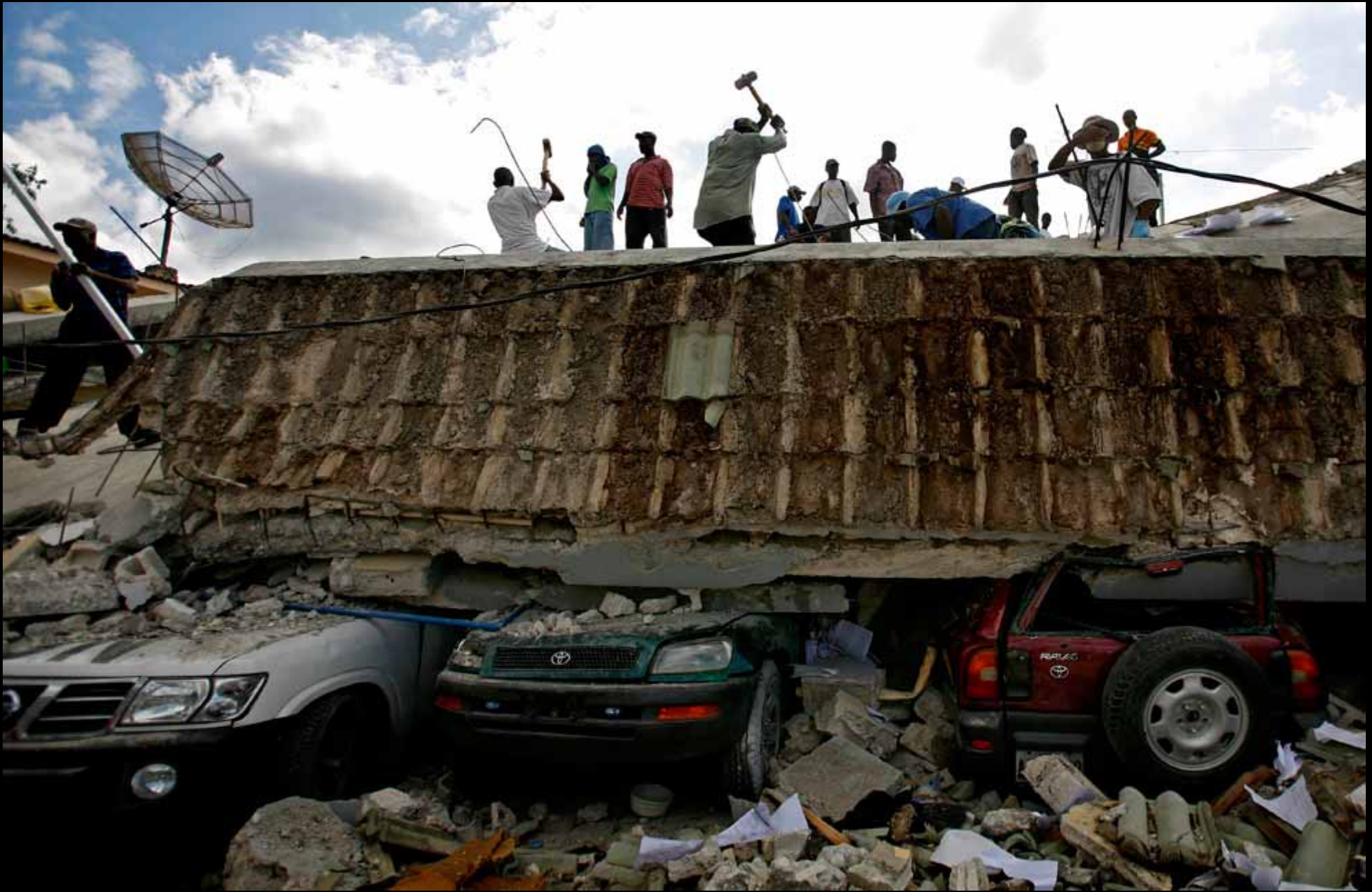
46 People search for survivors under the rubble of a collapsed building the day after an earthquake hit Port-au-Prince, Haiti, Wednesday, Jan. 13, 2010. #