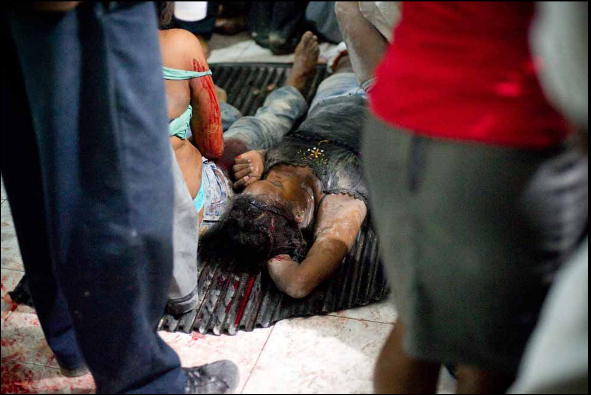
22 Injured women wait on the floor at the emergency clinic of Petionville on January 12, 2010 in Port-au-Prince, Haiti. #