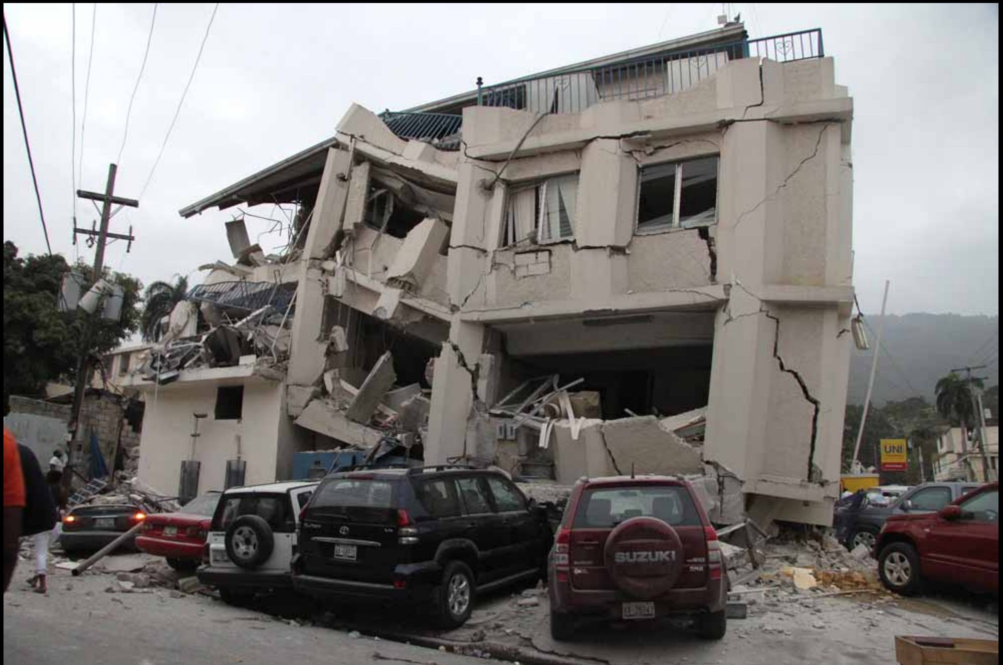
8 A quake-destroyed building in the streets of Port-Au-Prince, Haiti on January 12th, 2010. #