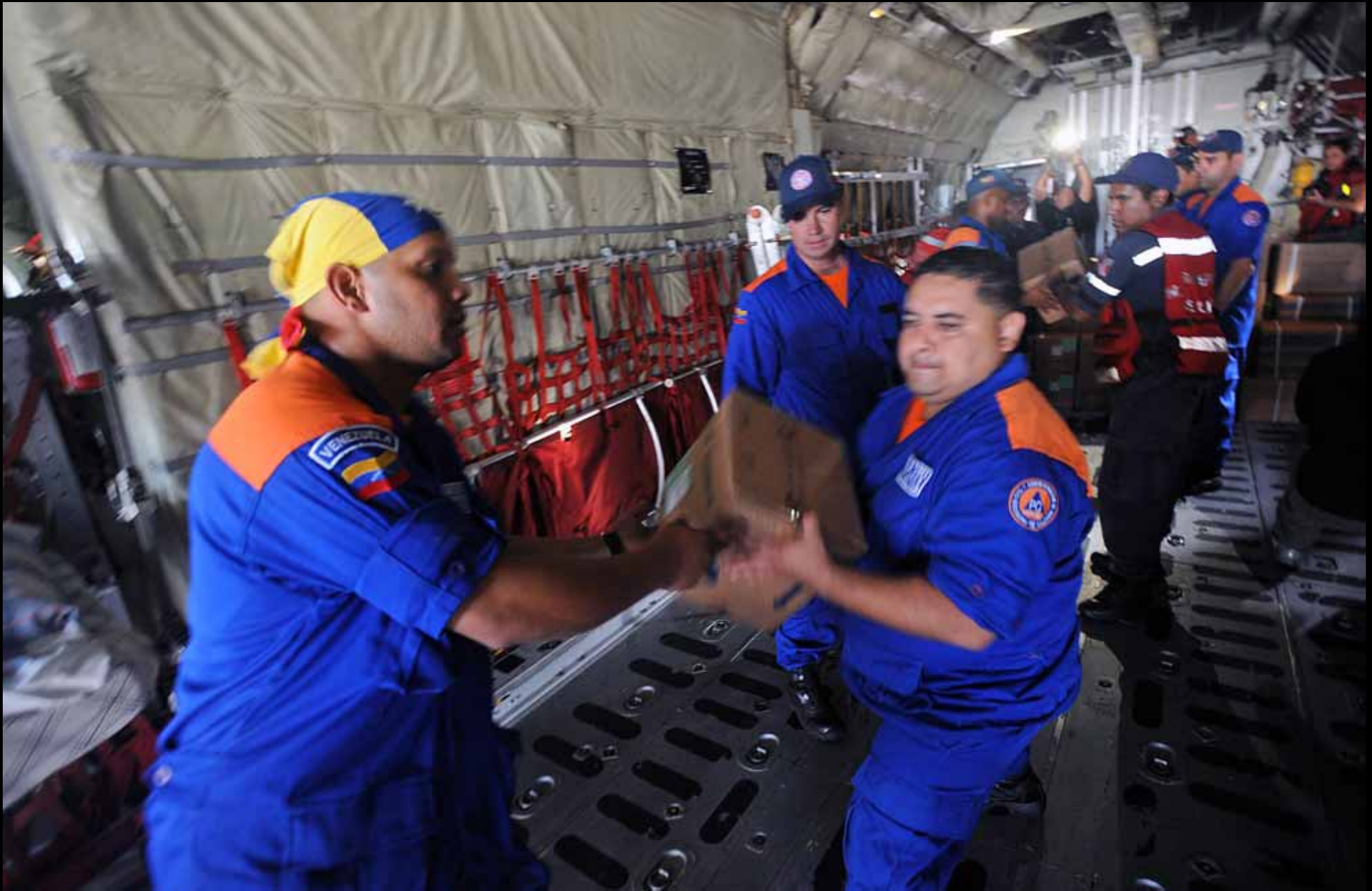
33 Venezuelan rescuers load medical equipment onto a plane heading to Port-au-Prince, Haiti, on January 13, 2010 at the Simon Bolivar international airport in Caracas, following a huge quake which rocked the impoverished Caribbean nation, toppling buildings and leaving hundreds of people missing and feared dead. #