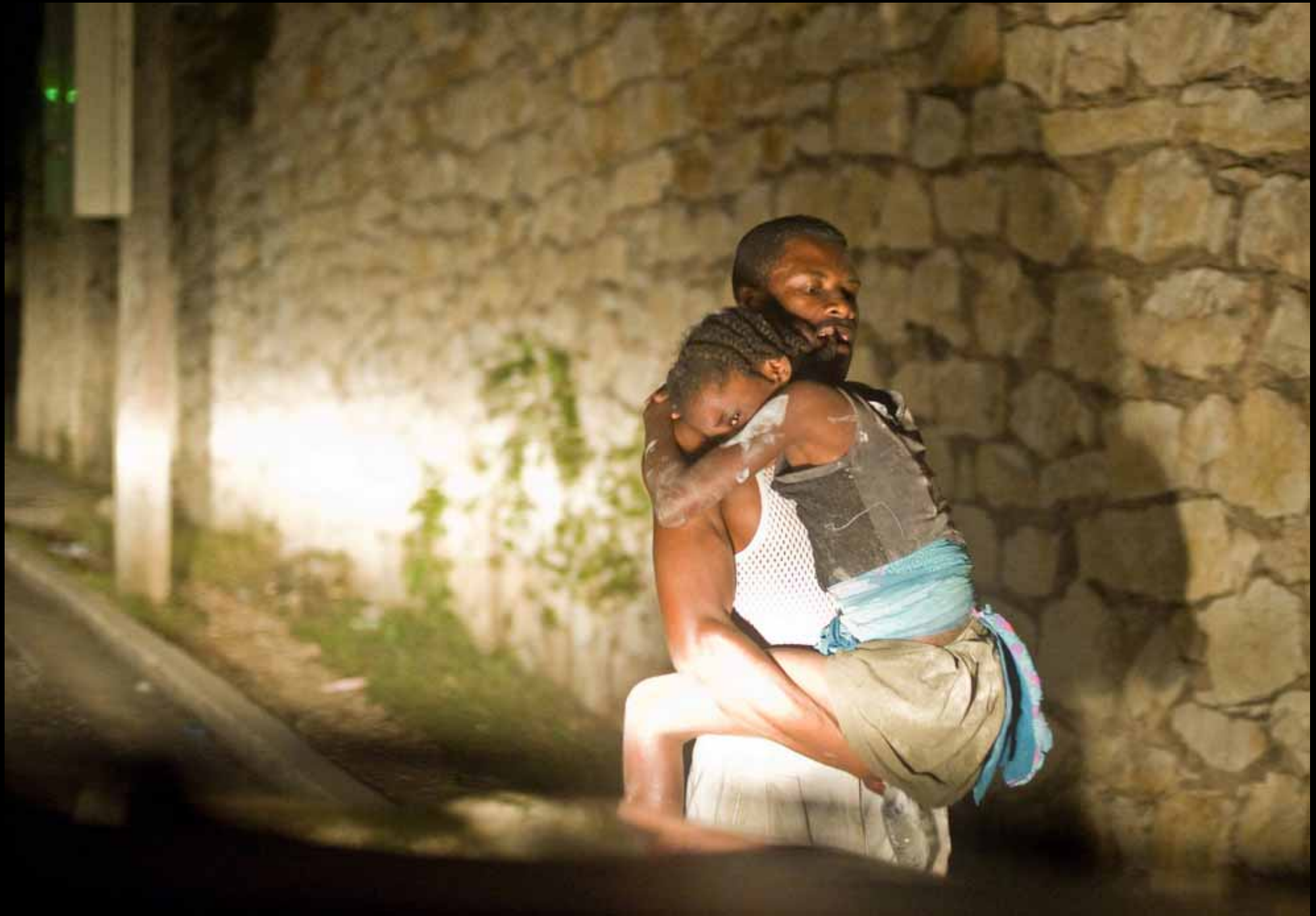
31 A father carries his daughter after a major earthquake on January 12, 2010 in Port-au-Prince, Haiti. #