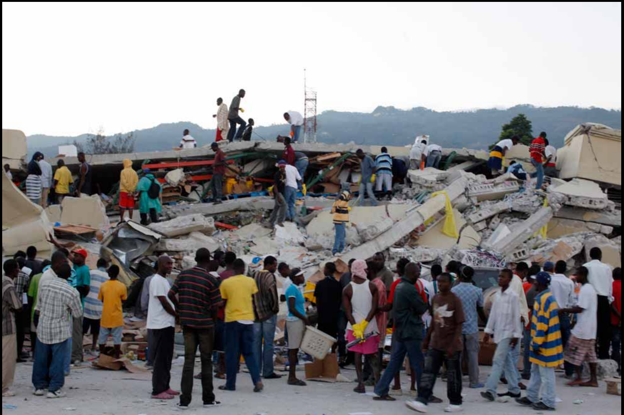
39 Residents search for survivors among the debris after an earthquake in Port-au-Prince January 13, 2010. #