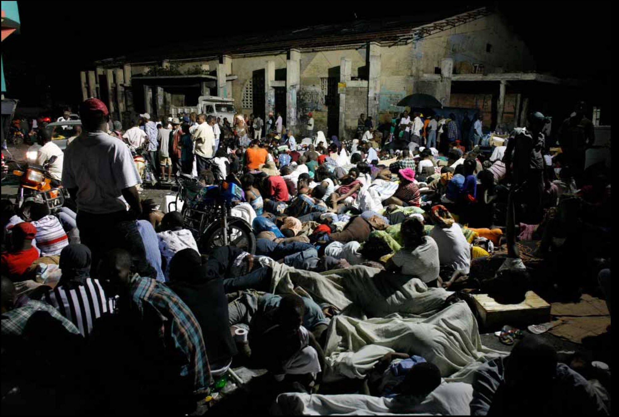
23 Residents sleep in the street after the earthquake in Port-au-Prince January 13, 2010. #