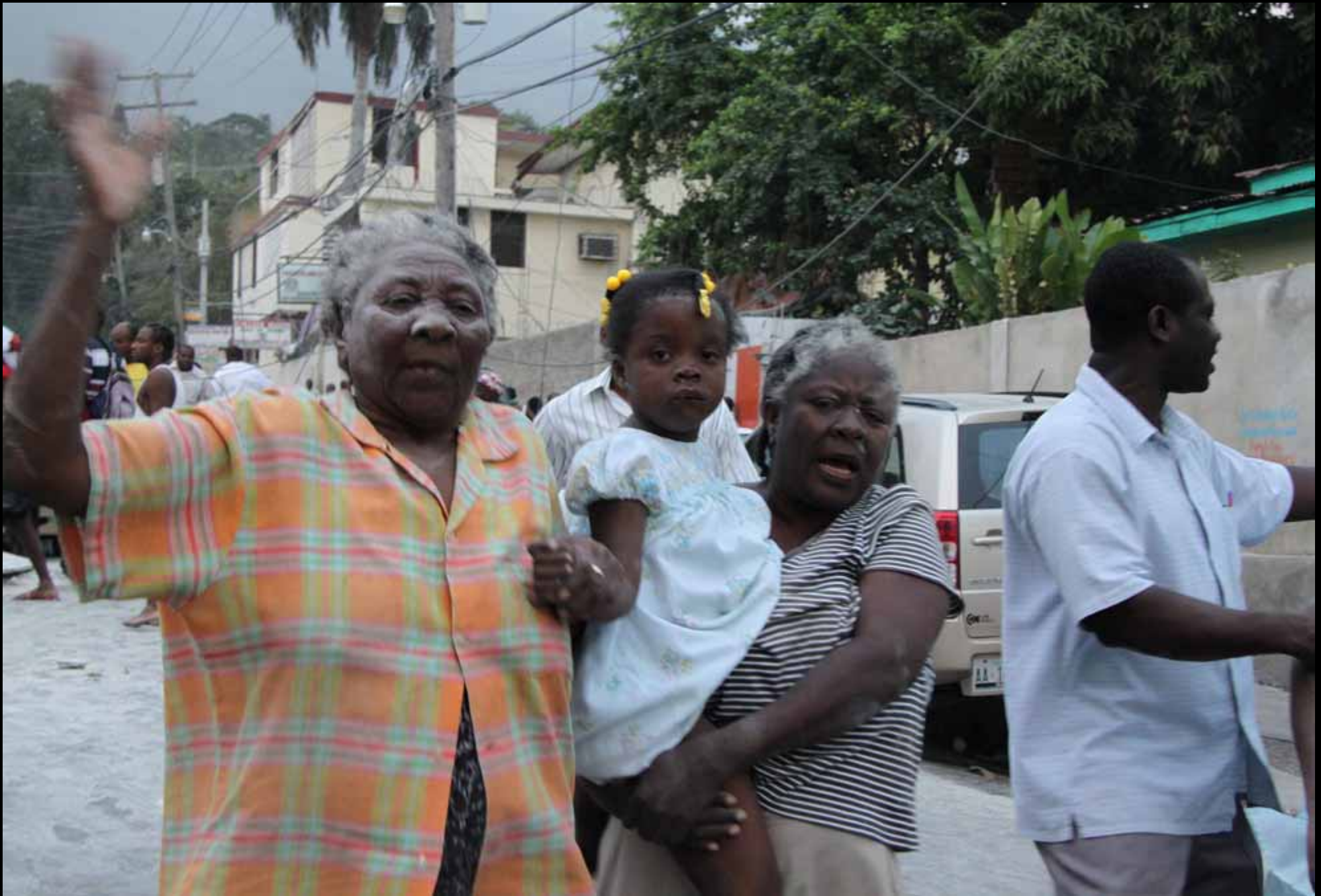
2 People seek safety in the aftermath of a severe earthquake on rue Capois in Port-Au-Prince, Haiti on January 12th, 2010. #