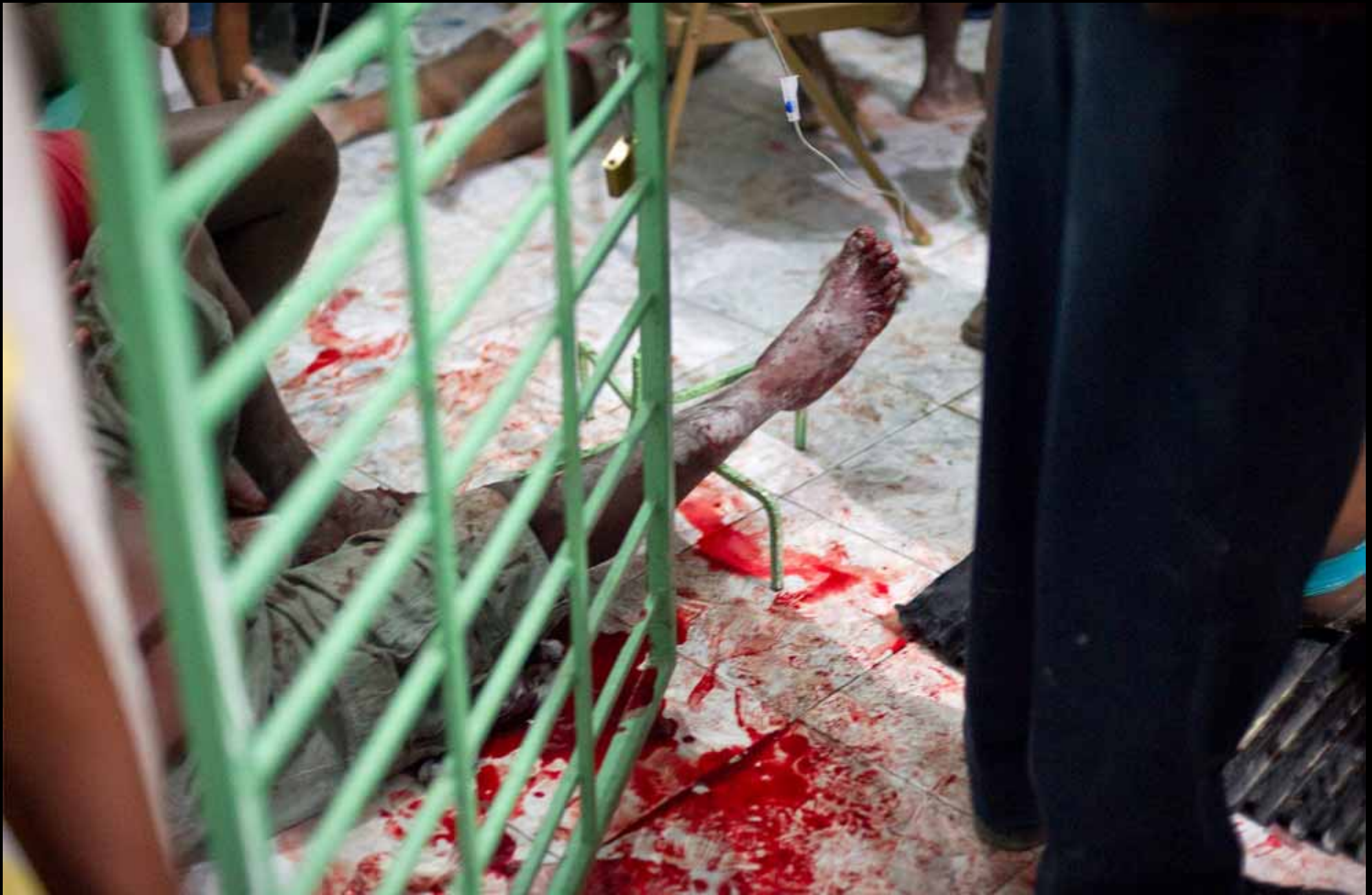
27 Earthquake survivors sit on a bloody floor in an emergency clinic in Petionville on January 12, 2010 in Port-au-Prince, Haiti. #