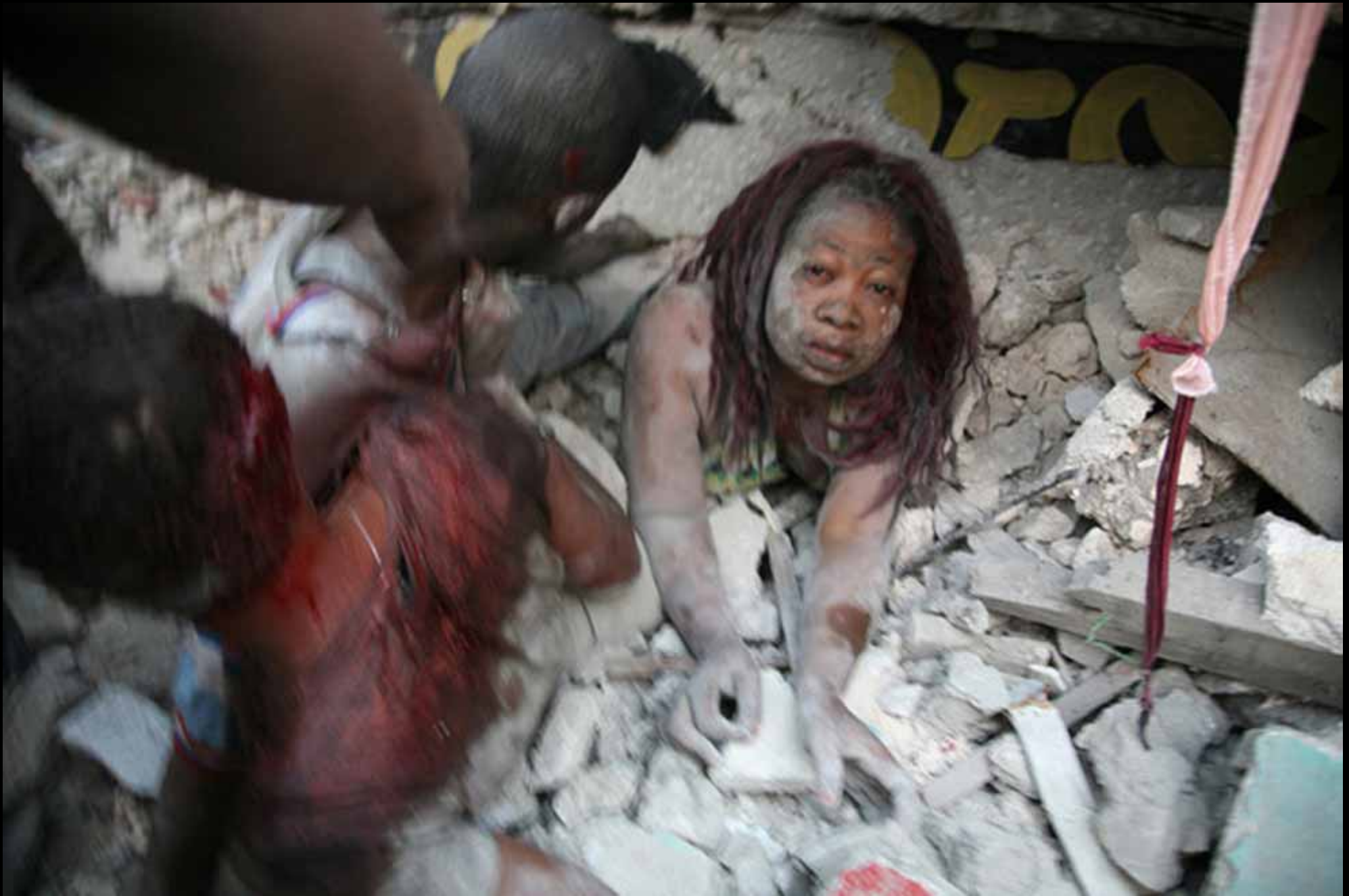
1 A Haitian woman is covered in rubble on January 12, 2010 in Port-au-Prince after a huge earthquake rocked the impoverished Caribbean nation of Haiti, toppling buildings and causing widespread damage and panic, officials and AFP witnesses said. A tsunami alert was immediately issued for the Caribbean region after the earthquake struck at 2153 GMT.