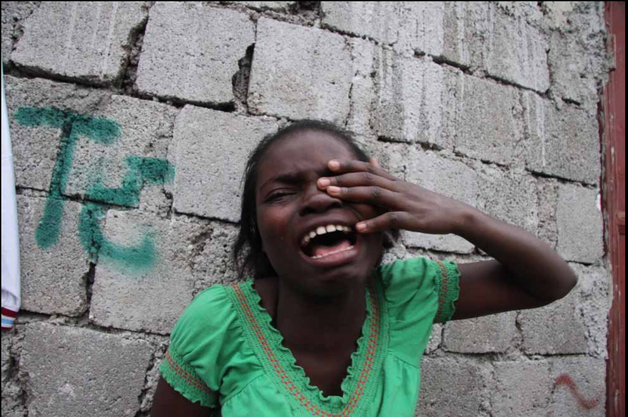
38 A girl reacts in the street shortly after a large earthquake struck in Port-au-Prince, Haiti on January 12th, 2010 #