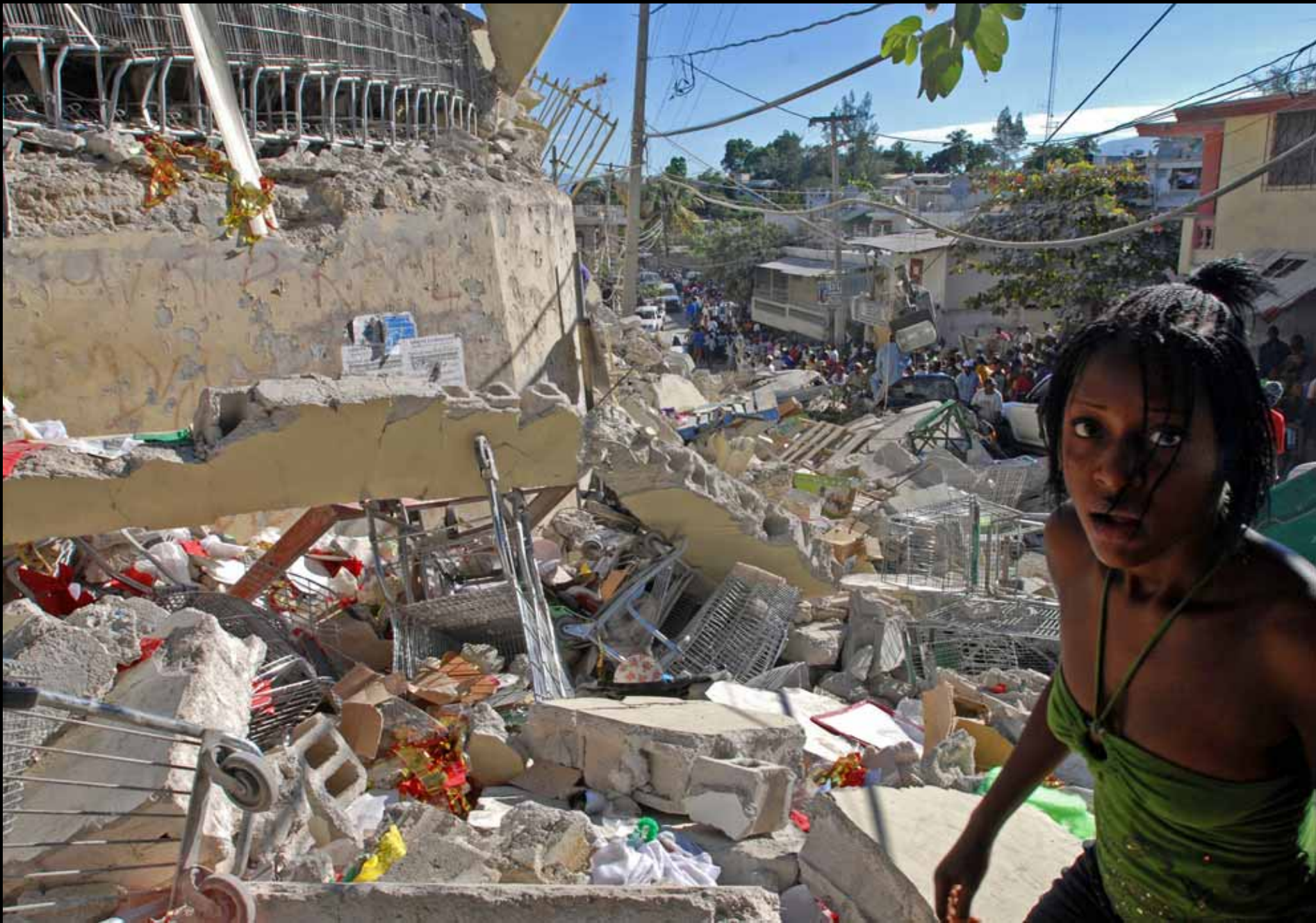
42 A day after the earthquake, a young woman climbs over shopping carts and the rubble of a collapsed store on January 13, 2010 in Port-au-Prince, Haiti. #