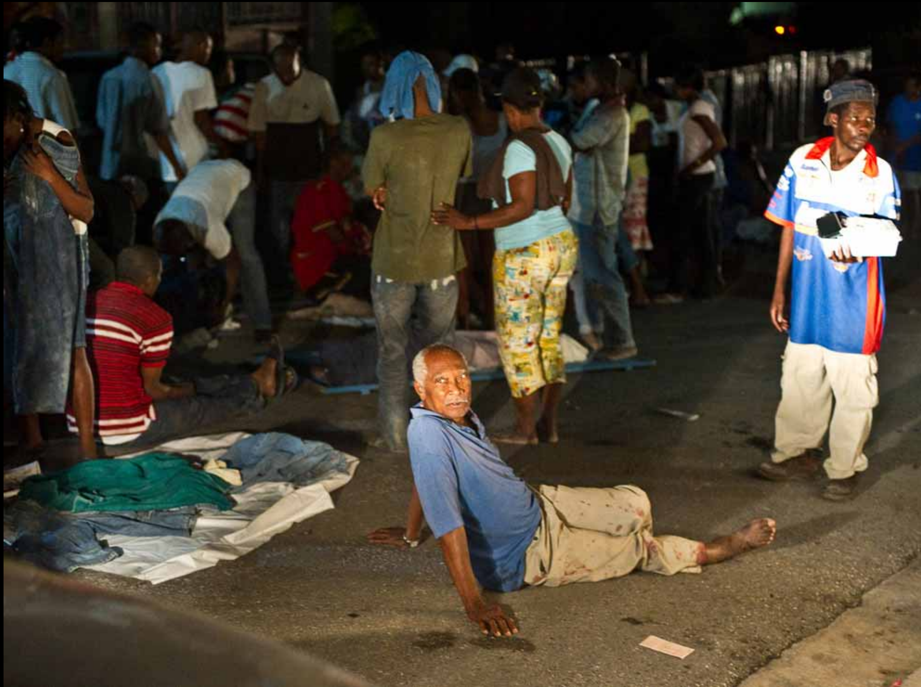
25 A man with two broken legs sits in the street amongst other wounded people, following a major earthquake on January 13, 2010 in Port-au-Prince, Haiti. #