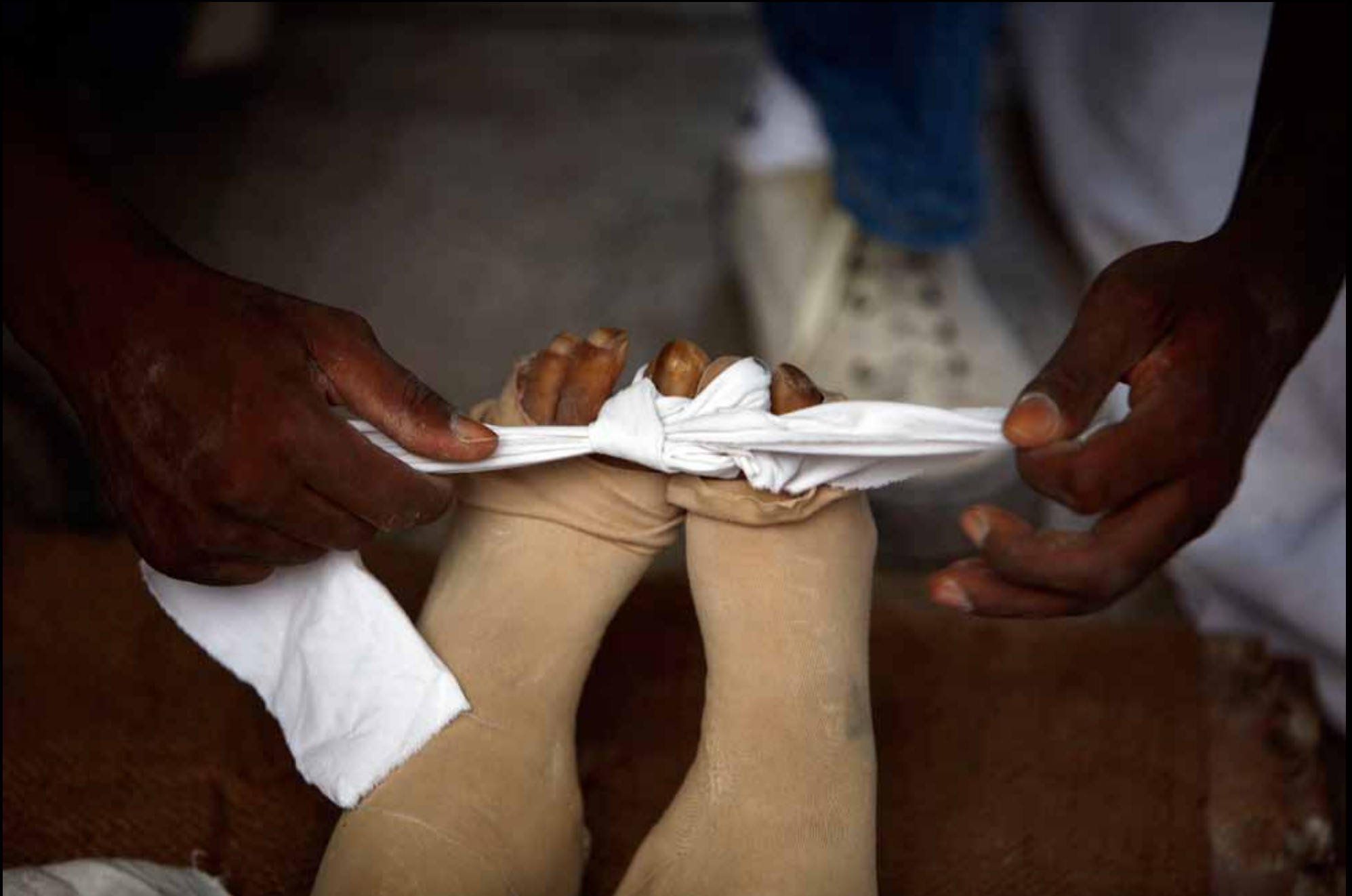
43 A person ties a dead woman's feet together as she is attended to on the side of a road the day after an earthquake hit Port-au-Prince, Haiti, Wednesday, Jan. 13, 2010. #