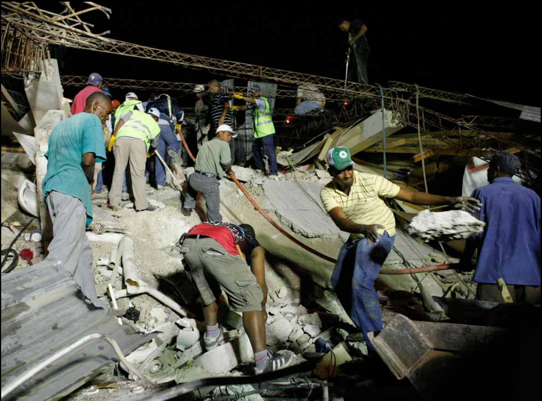
20 Residents search for victims after an earthquake in Port-au-Prince January 13, 2010. #