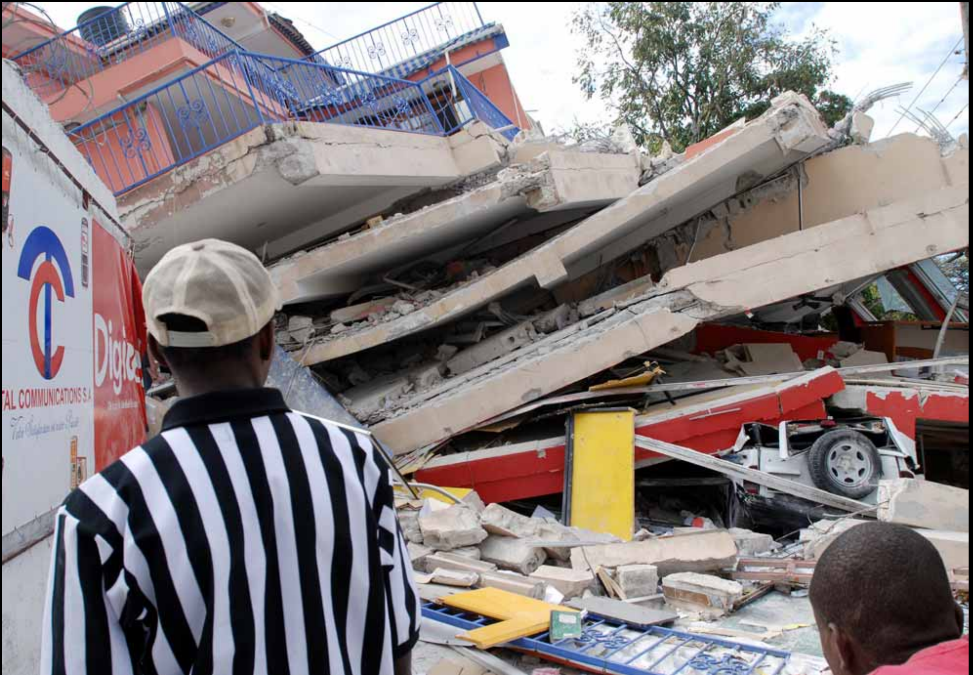
45 People look at what remains of a six-story communications building on January 13, 2010 in Port-au-Prince, Haiti. #