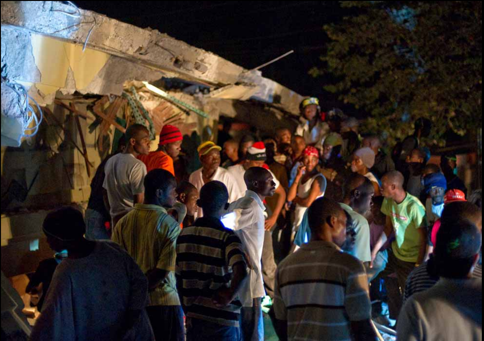
29 People search for survivors amongst the rubble of the Caribbean Super Market in Delmas on January 12, 2010 in Port-au-Prince, Haiti. #