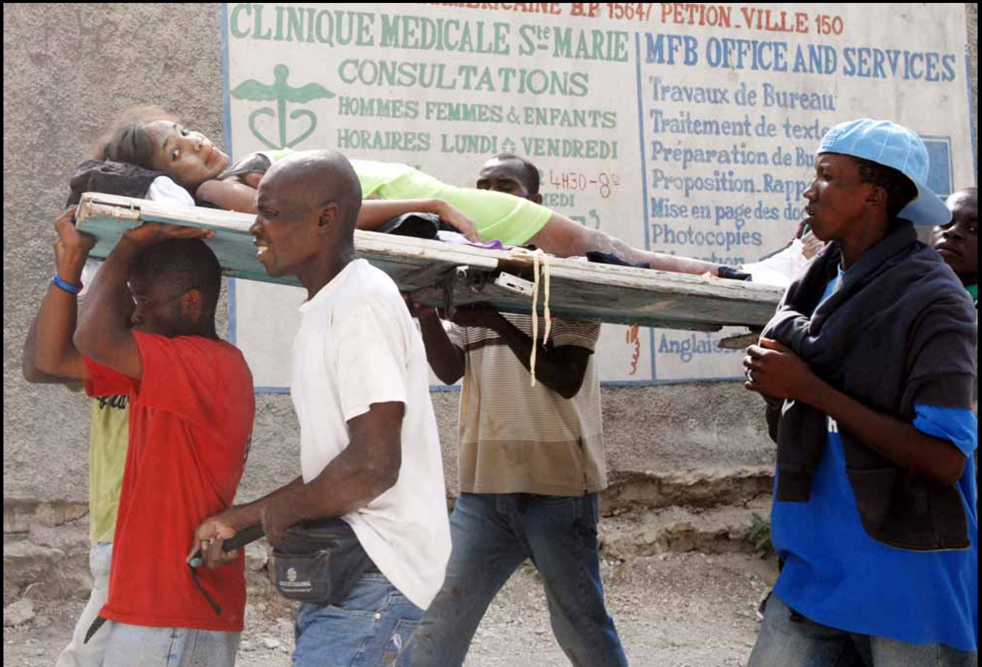
44 Men carry an injured woman near a clinic on January 13, 2010 in Port-au-Prince, Haiti. (THONY BELIZAIRE/AFP/Getty Images) #