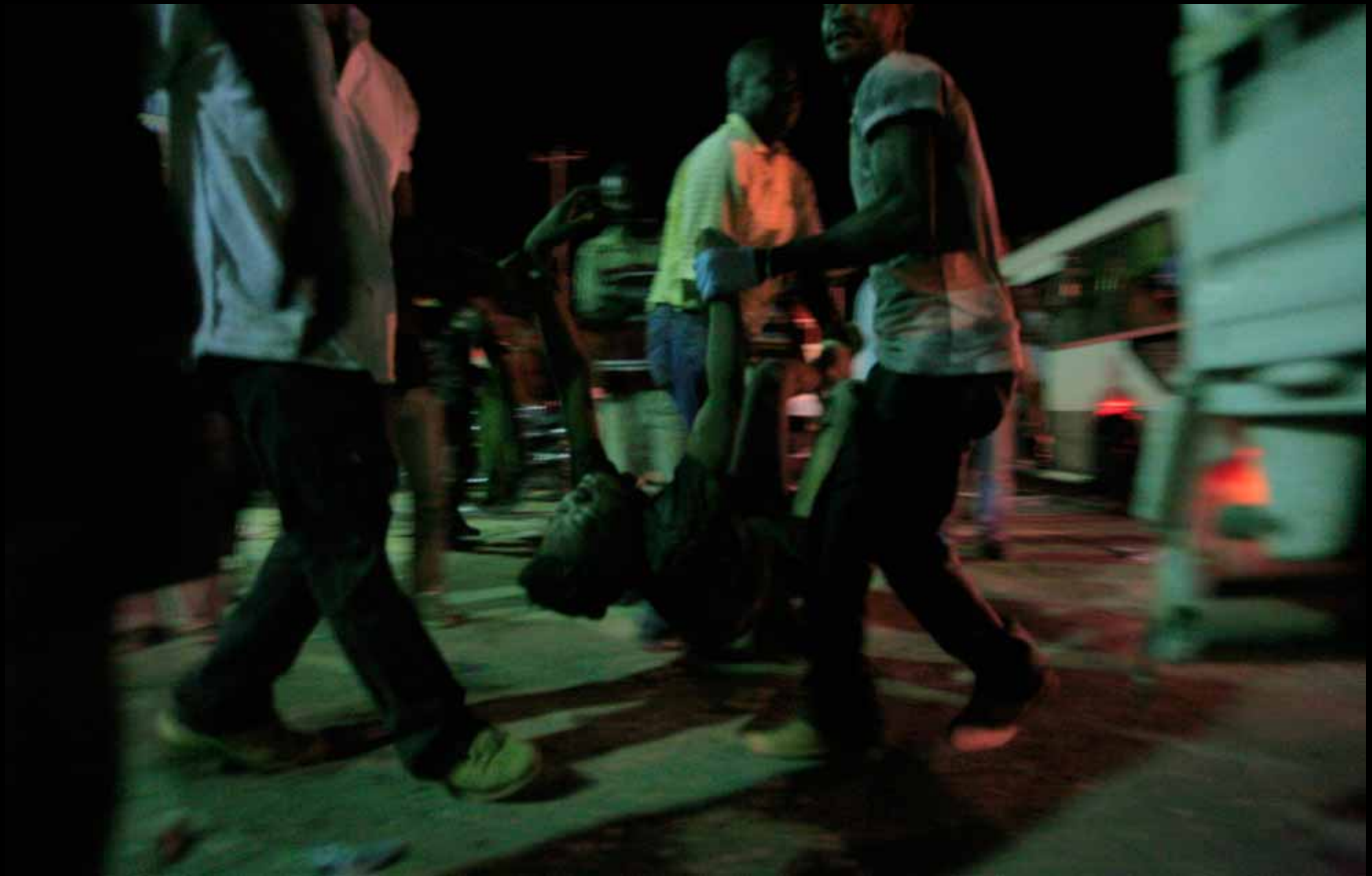
17 Residents wait for medical treatment after an earthquake in Port-au-Prince January 13, 2010. #