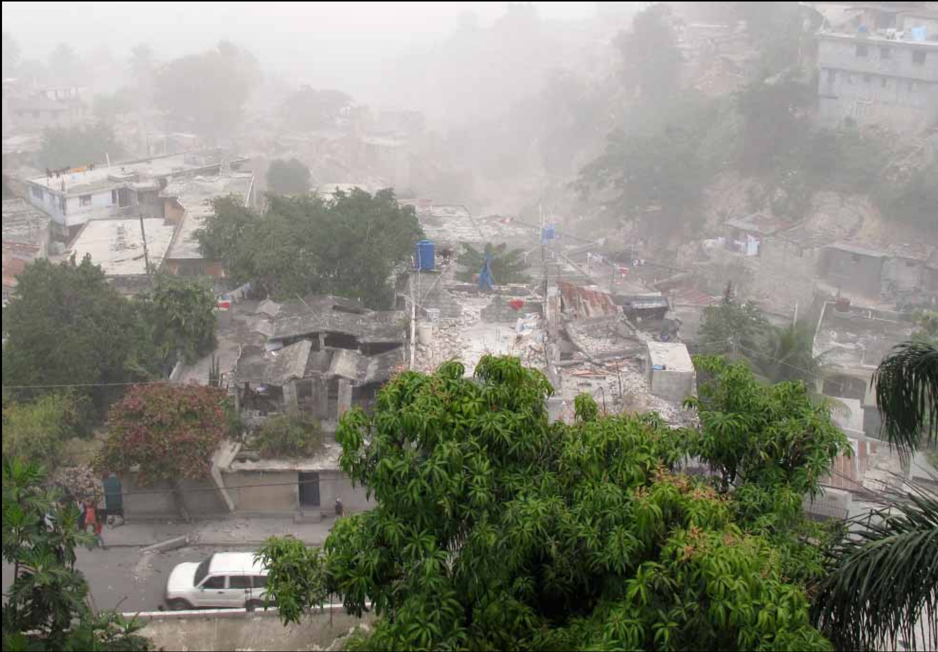
6 Buildings are seen damaged in the neighborhood of Petionville, Port-Au-Prince shortly after an earthquake hit Haiti, January 12, 2010. The 7.0 magnitude quake rocked Haiti, killing possibly thousands of people as it toppled the presidential palace and hillside shanties alike and leaving the poor Caribbean nation appealing for international help. #