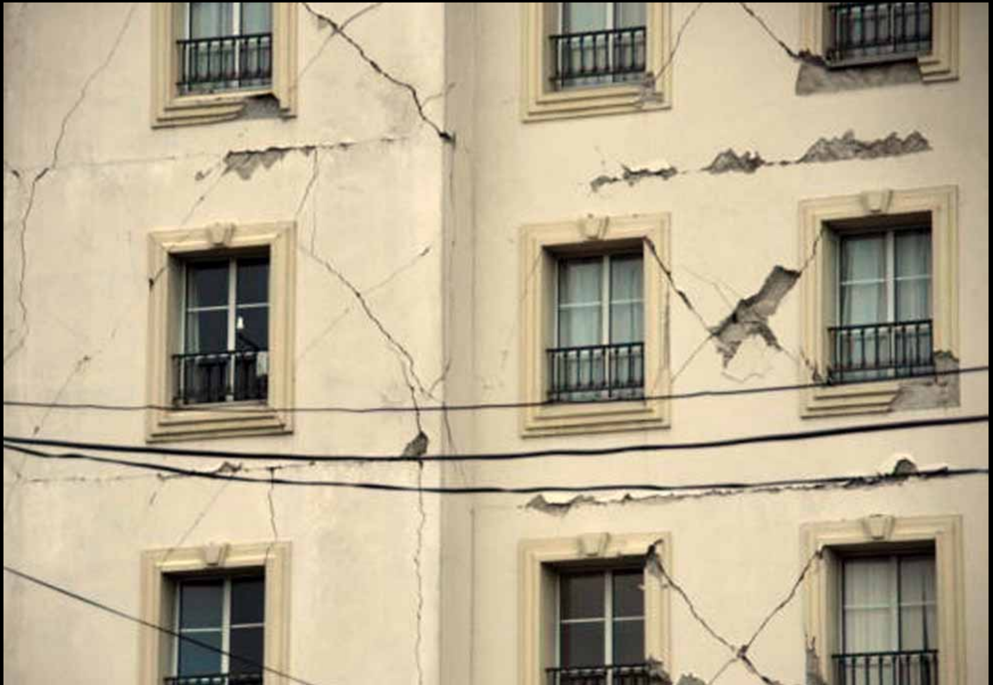
12 Criss-cross cracking and other damage to a building is seen on January 12, 2010 in Port-au-Prince, Haiti after a huge earthquake. #