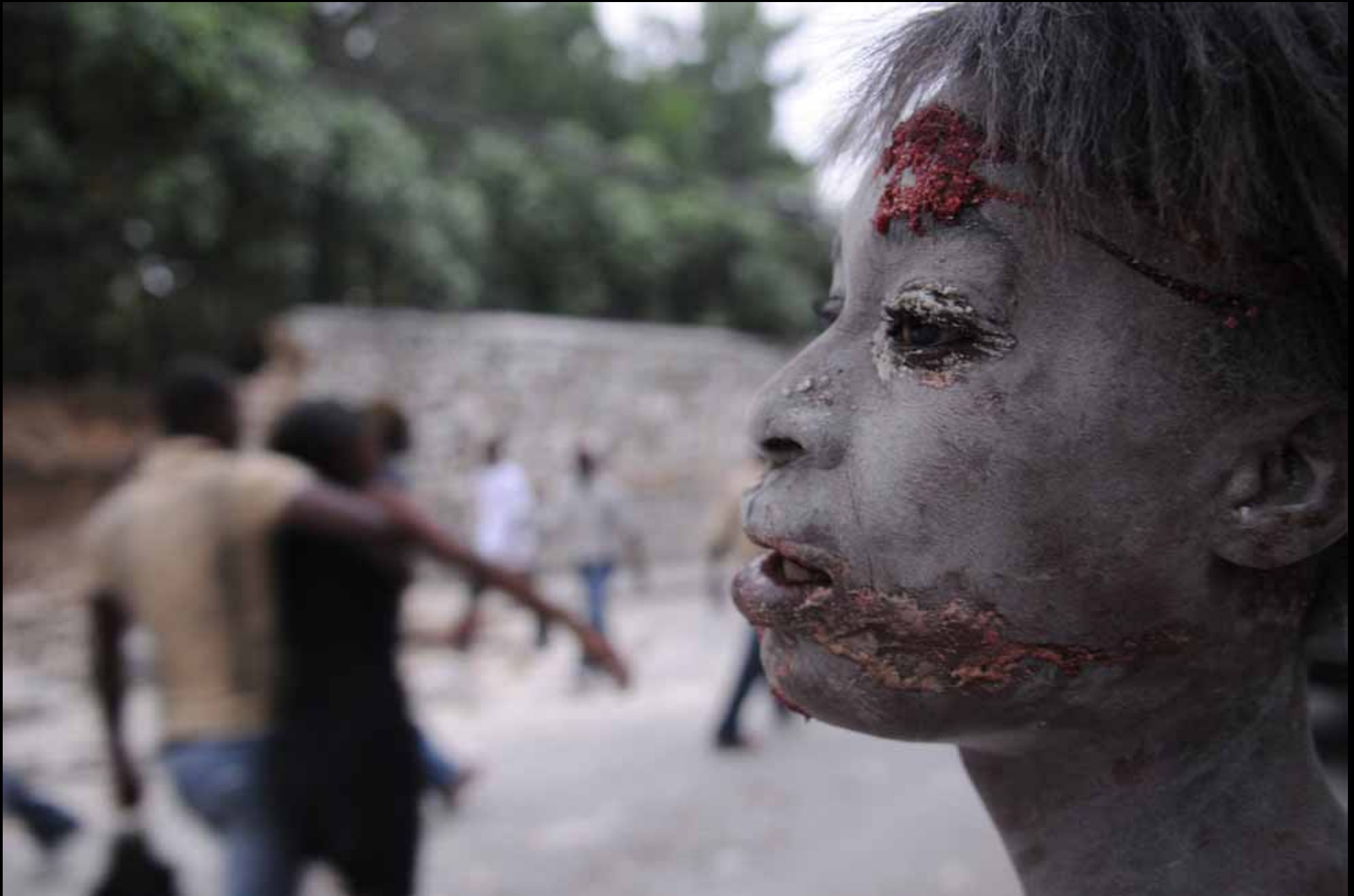
32 An injured person is seen in the street after an earthquake hit Port-au-Prince, Haiti, Tuesday, Jan. 12, 2010. #