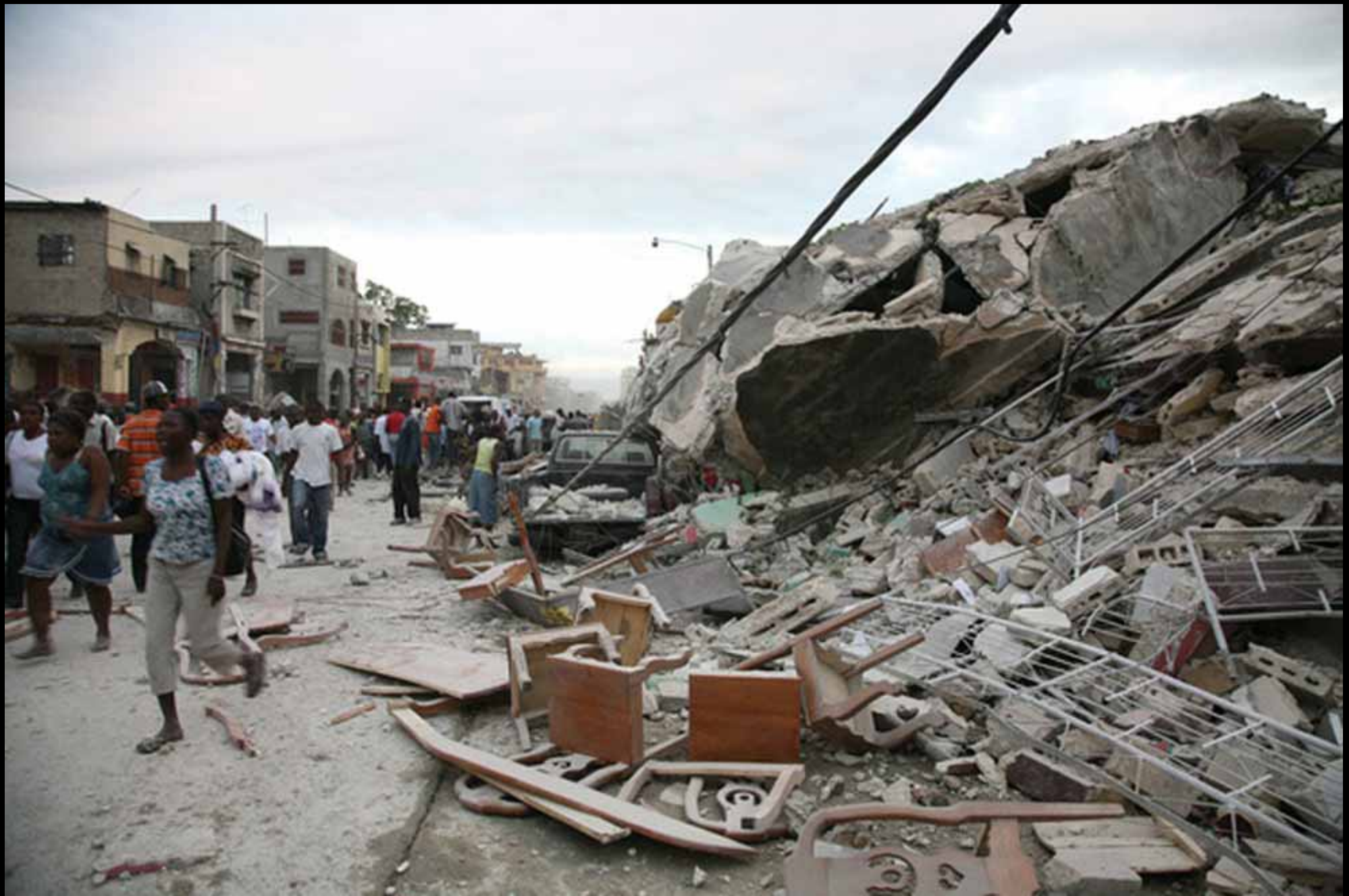
10 Haitians walk past damaged buildings on January 12, 2010 in Port-au-Prince Haiti after a huge earthquake. #