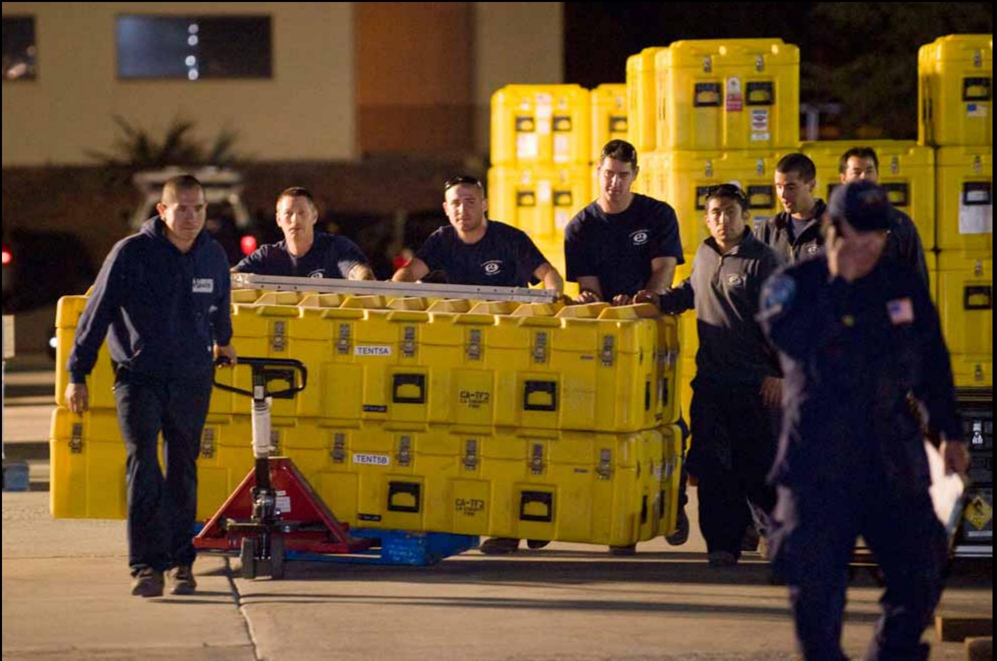
36 Los Angeles County Fire Department urban search and rescue team load equipment in the Pacoima area of Los Angeles January 12, 2010. The team will travel to Haiti to help with rescue efforts after a magnitude 7.0 earthquake hit the capital Port-au-Prince. #