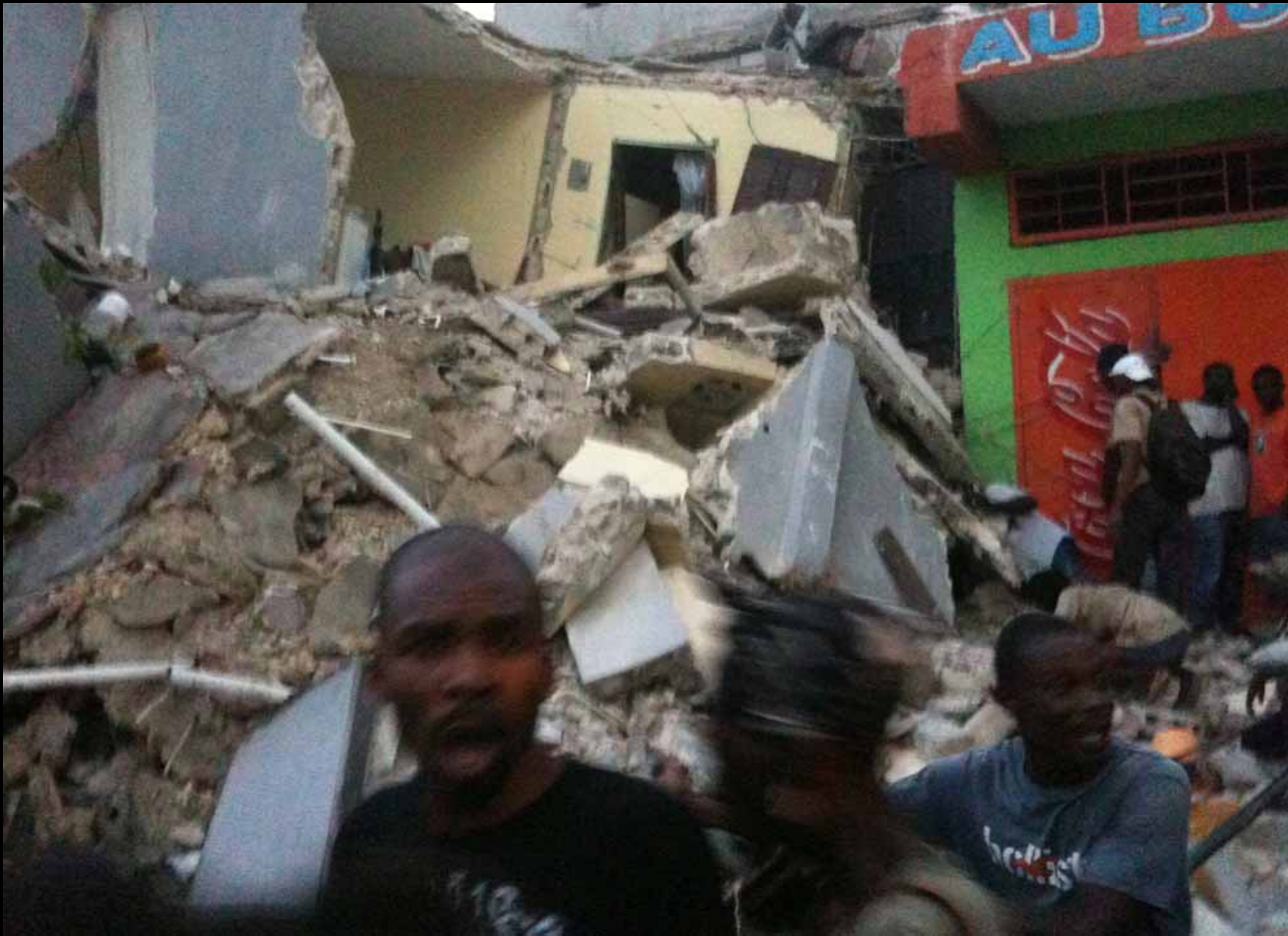
5 This photo provided by Carel Pedre shows people running past rubble of a damaged building in Port-au-Prince, Haiti, Tuesday, Jan. 12, 2010. The largest earthquake ever recorded in the area shook Haiti on Tuesday, collapsing a hospital where people screamed for help. (AP Photo/Carel Pedre) #